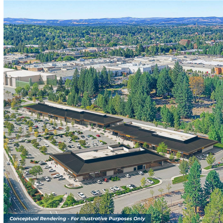
Conceptual Rendering - For Illustrative Purposes Only