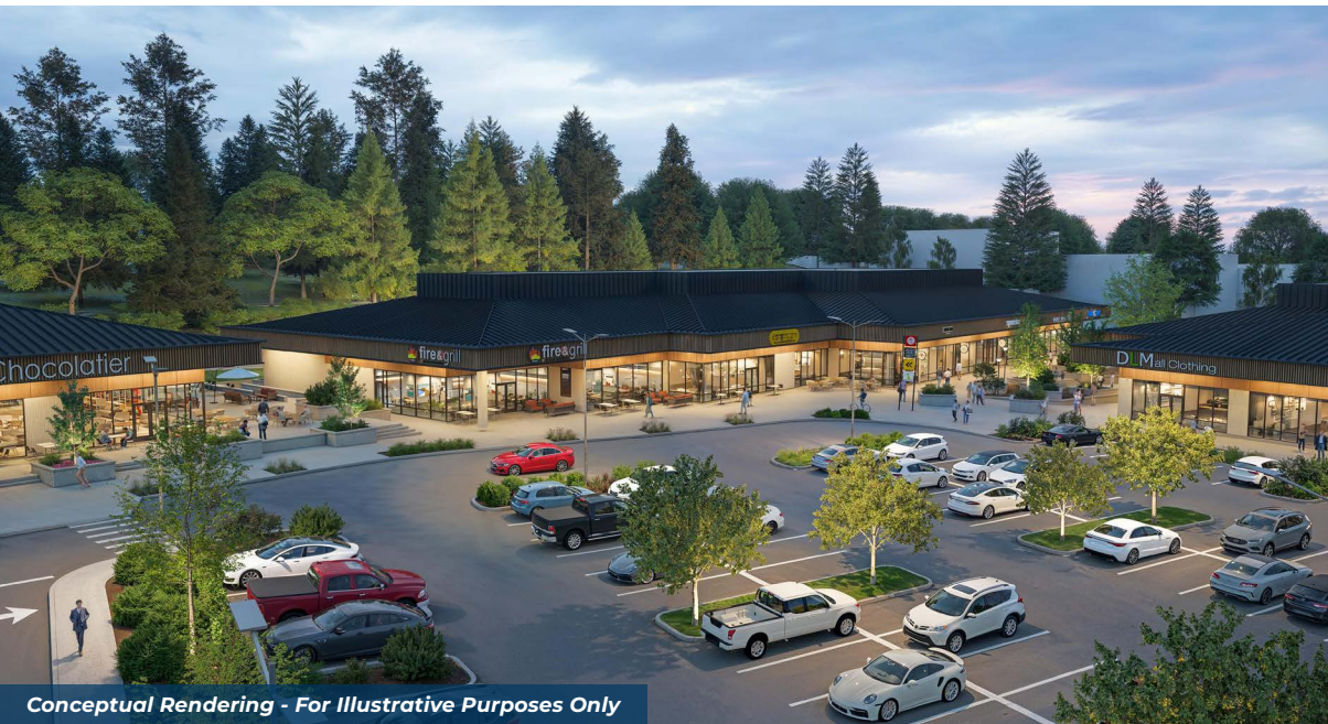
Conceptual Rendering - For Illustrative Purposes Only