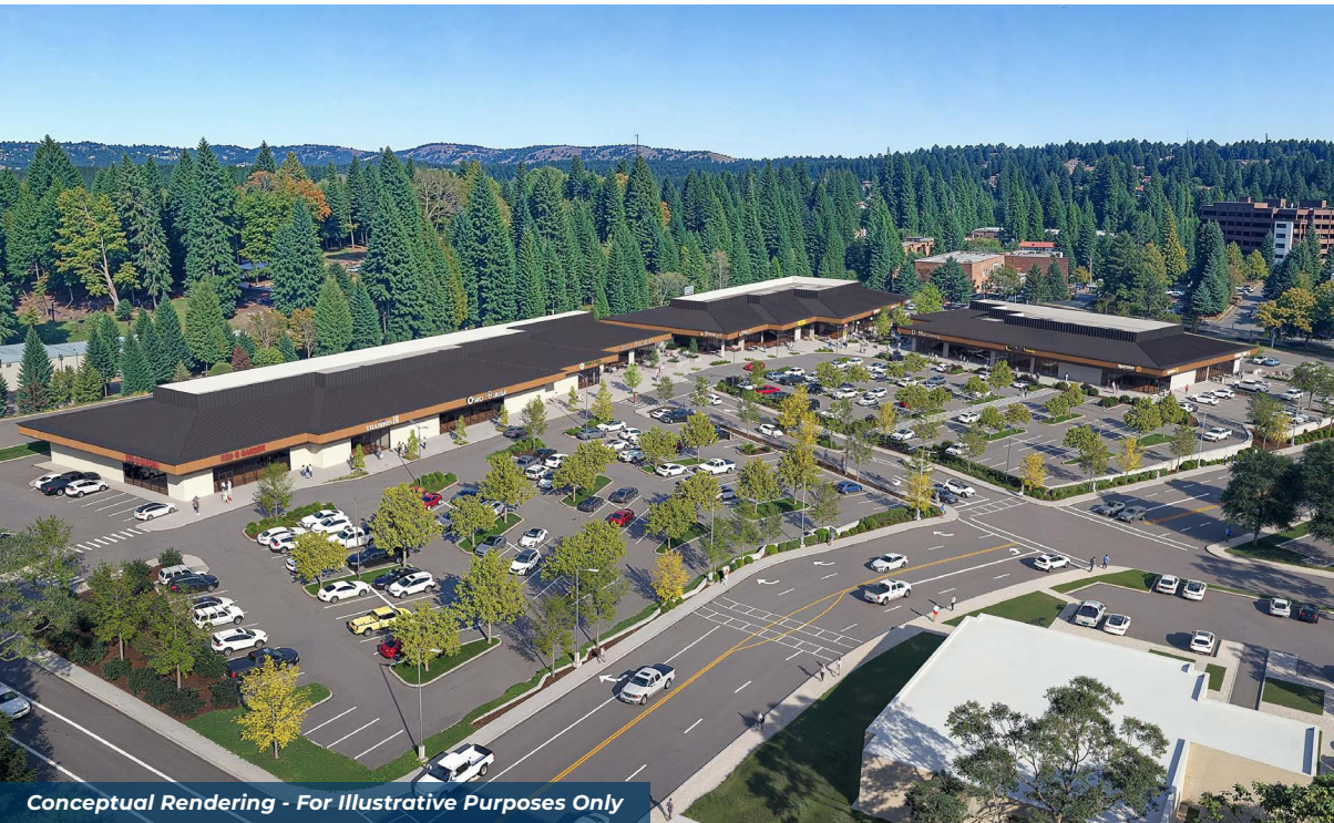
Conceptual Rendering - For Illustrative Purposes Only