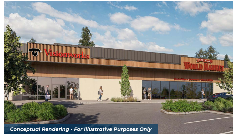
Conceptual Rendering - For Illustrative Purposes Only