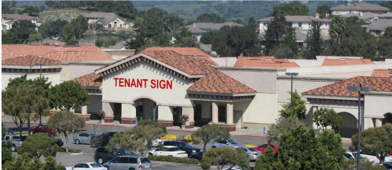
03 – 24,000 SF Anchor Space Frontage