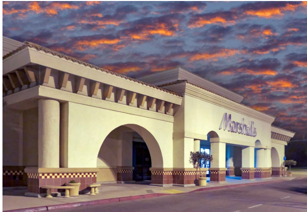
05 – Marshall's anchors the eastern building of Phase I