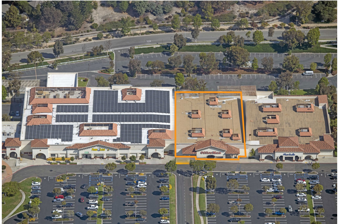
02 – Aerial of Suite D located between Food4Less and Marshalls