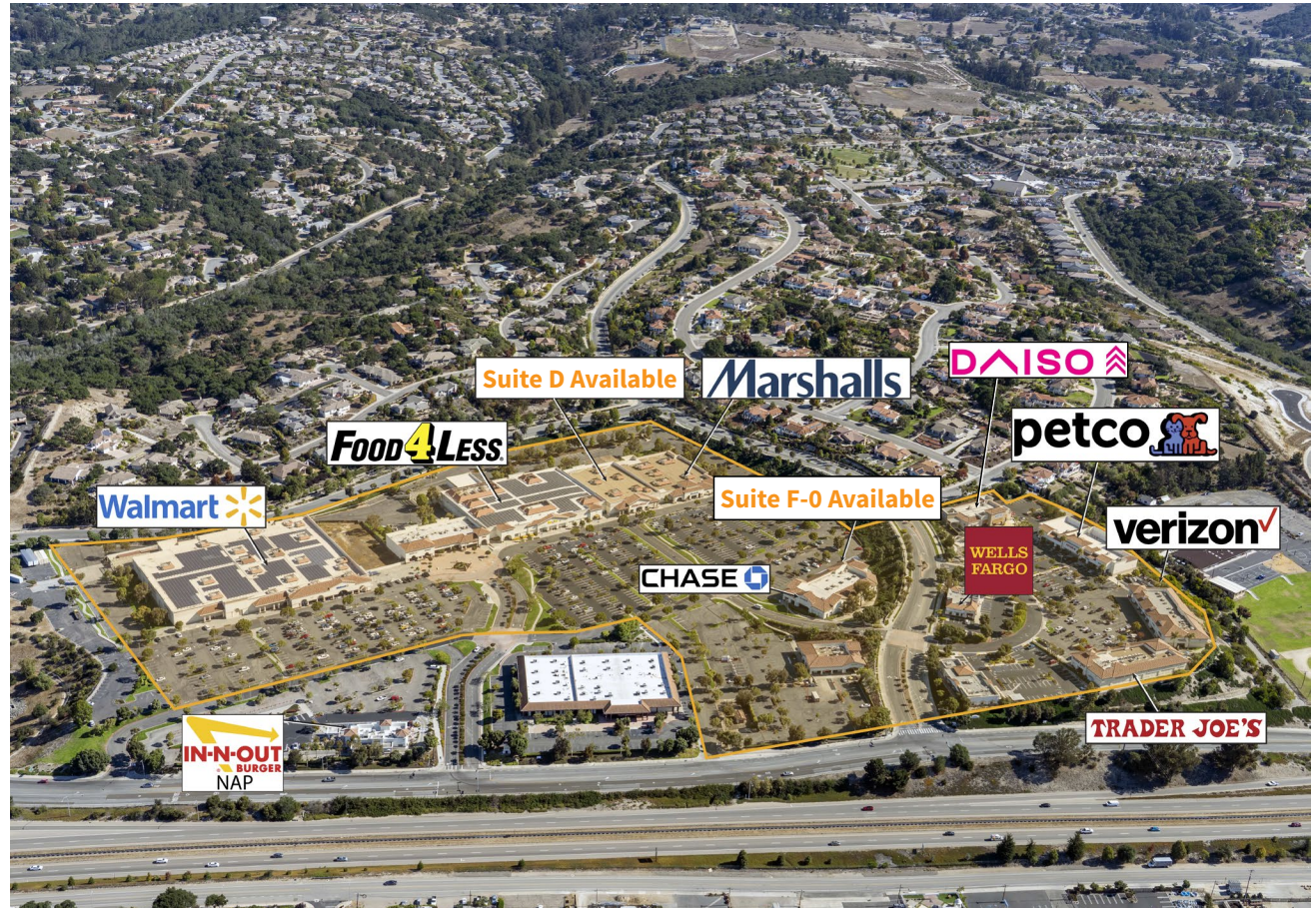
08 – Aerial view of Five Cities Center