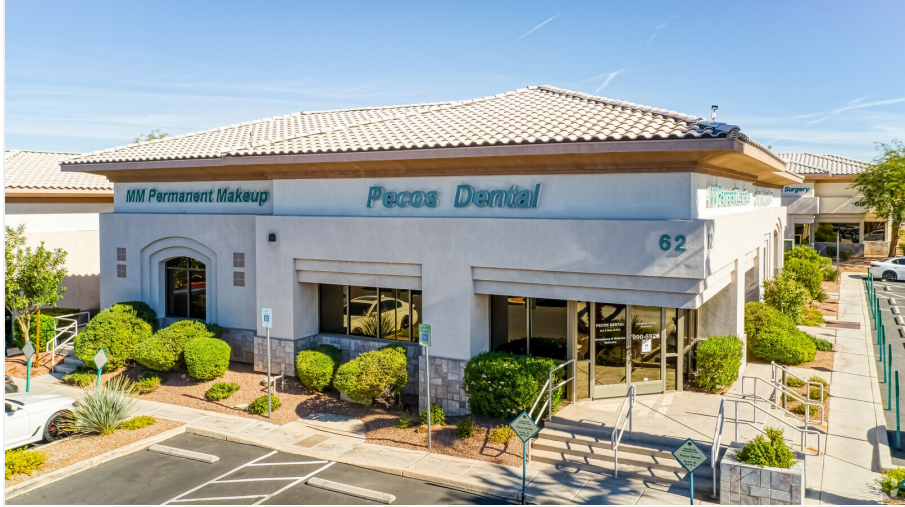
The Building Built out Dentist office Medical office Plug In