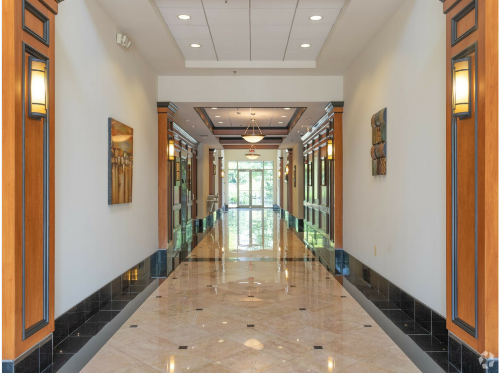
Lower Level Lobby