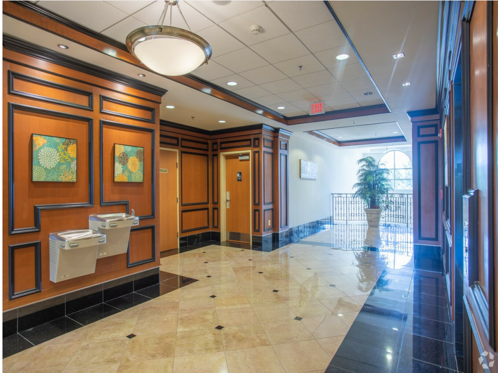
Upper Level Lobby