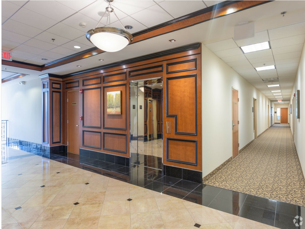
Upper Level Lobby