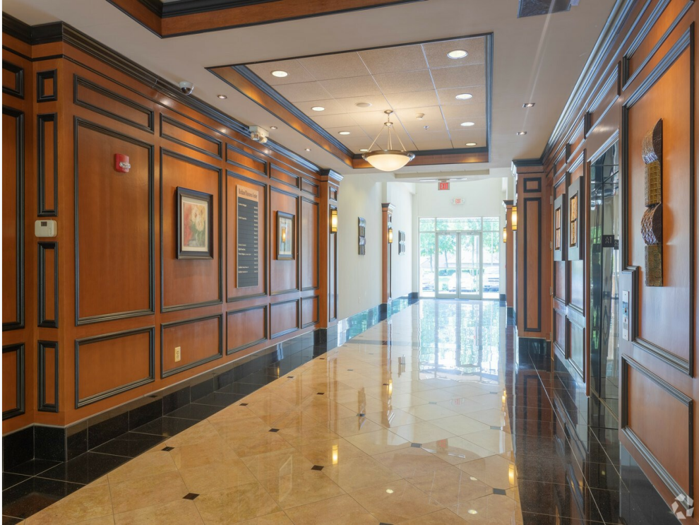
Lower Level Lobby/Elevators