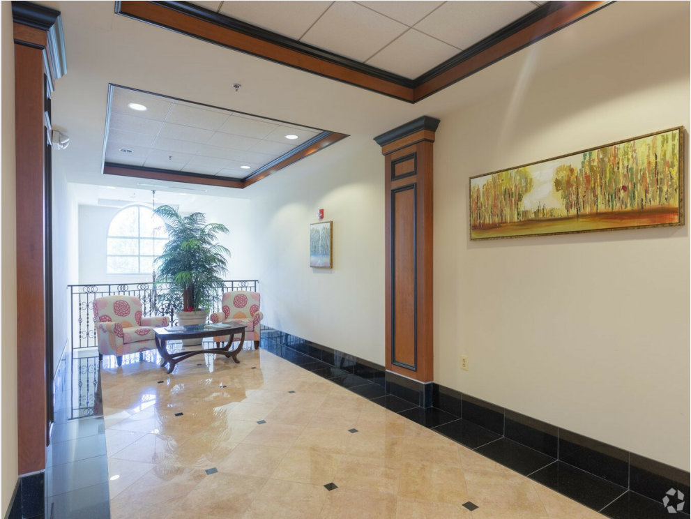
Upper Level Lobby