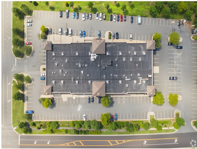
90 Degree Look Down