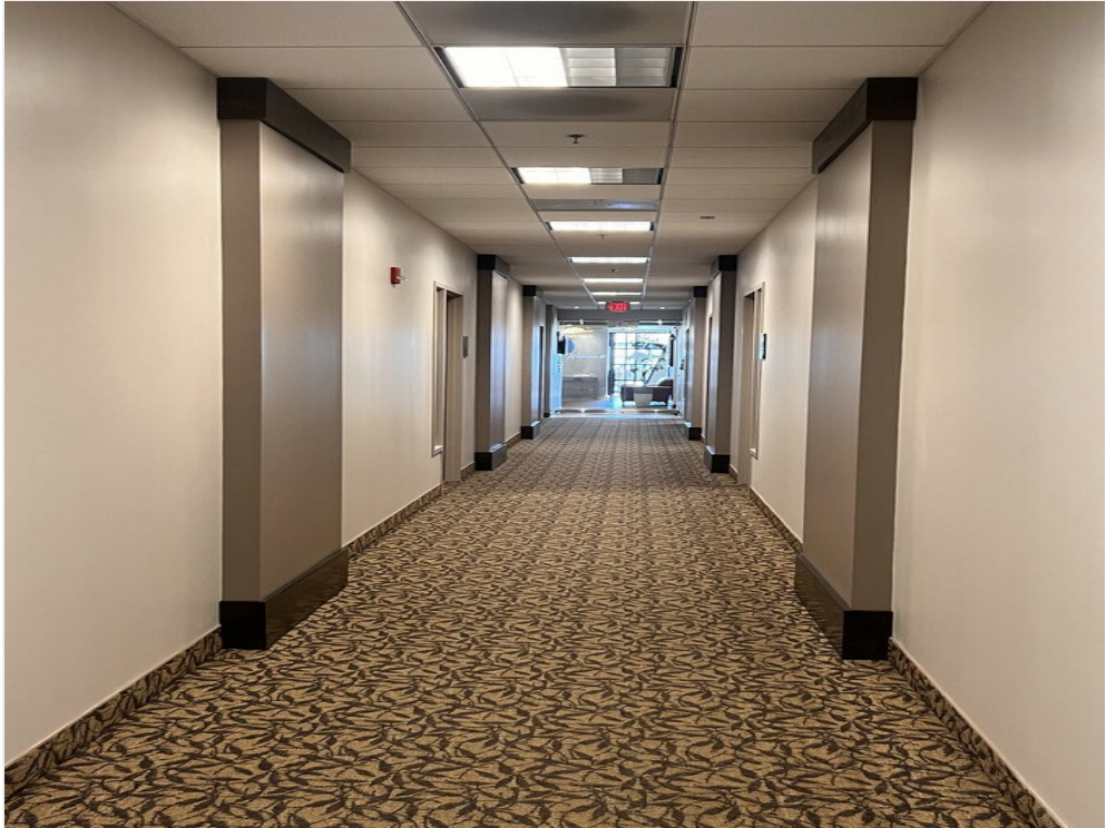
2nd floor hallway