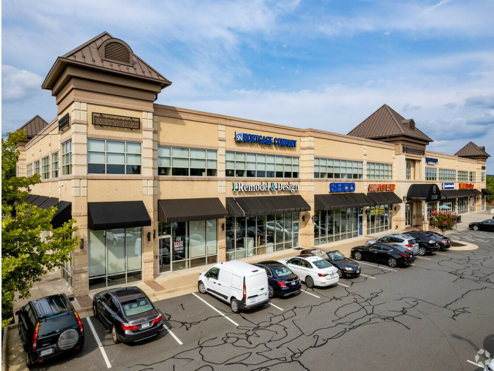
21430 Cedar Dr