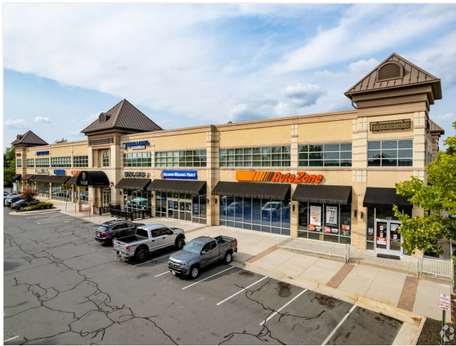
21430 Cedar Dr

The current unit is 3000 s.f. Prime Retail with direct signage on Rt. 7. Open floor plan. The unit may be expanded to approx. 5000 S.F. or modified to a smaller sq. footage of approx. 1045 s.f. on the Maple Leaf side of the center, and approx. 2000 s.f. on Rt. 7. See attached plans for modification details. Ample storefront parking. Two Glass storefront entrances on Rt. 7 and Maple Leaf Rd. Move in! See video tour. Rates subject to change based on unit configuration.