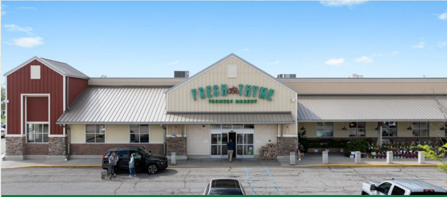
220 S. CREASY LANE LAFAYETTE, IN