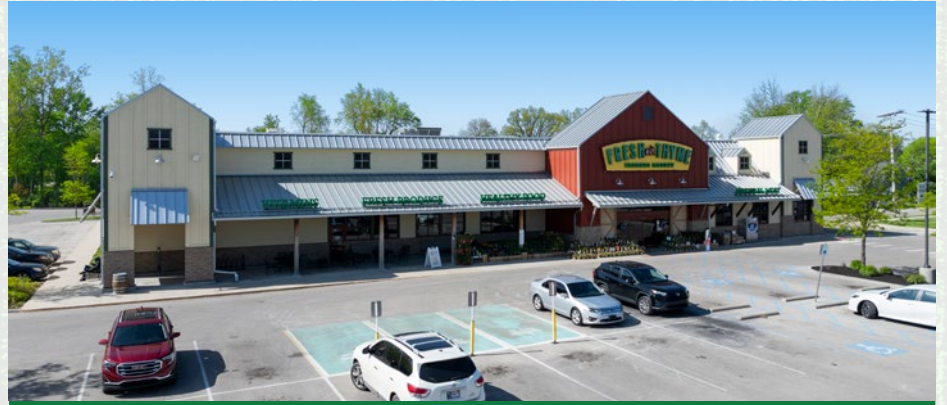
505 W MCGALLIARD ROAD MUNCIE, IN