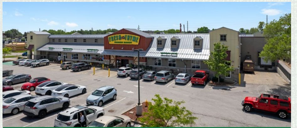
9920 LIN FERRY DRIVE GREEN PARK, MO