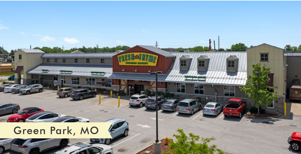
Green Park, MO