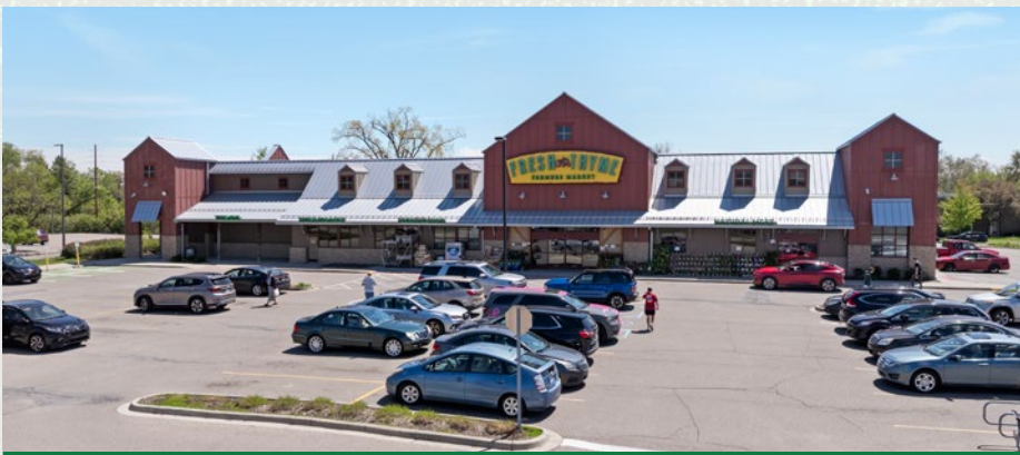
2985 WASHTENAW AVENUE YPSILANTI, MI