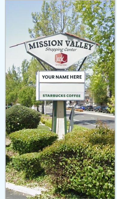
Top Pylon Sign With Major Visibility to El Camino Real