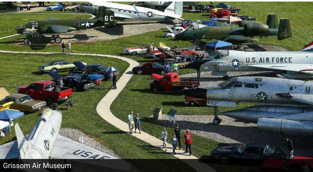
Grissom Air Museum