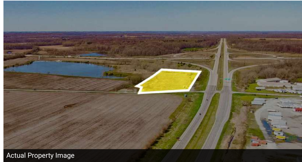
Actual Property Image