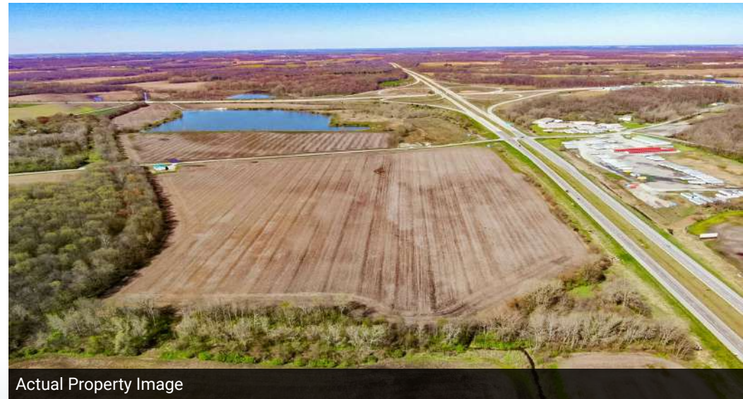
Actual Property Image