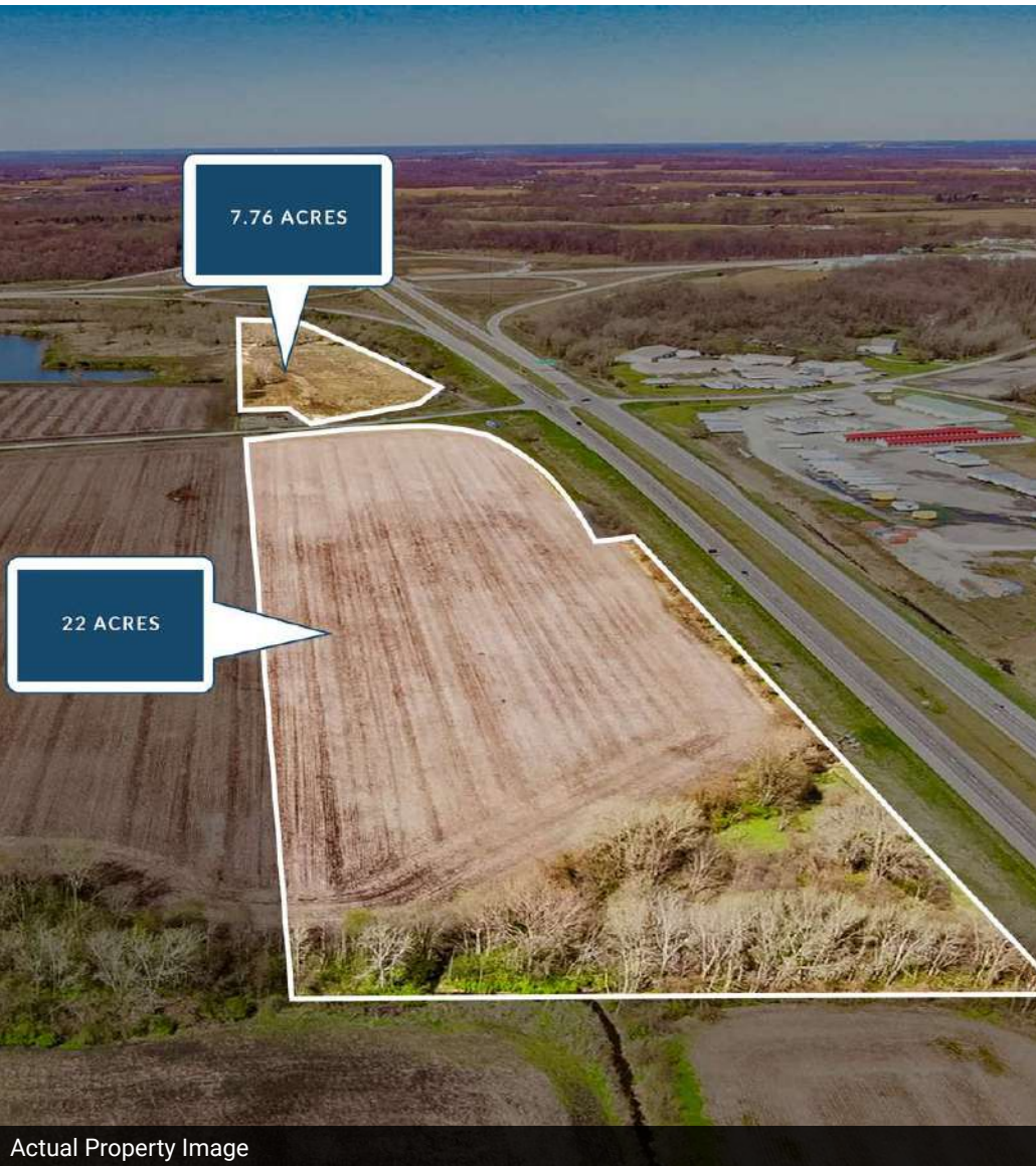
Actual Property Image