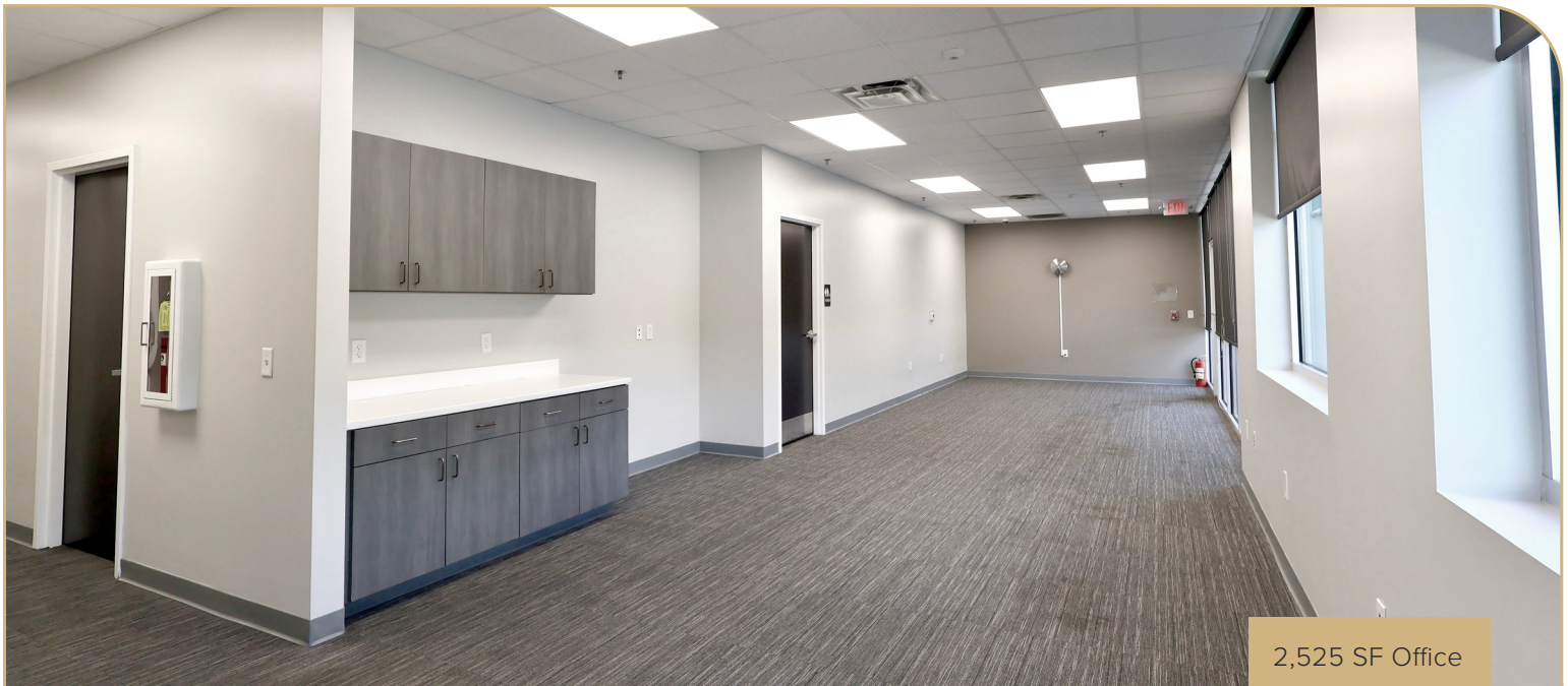
2,525 SF Office