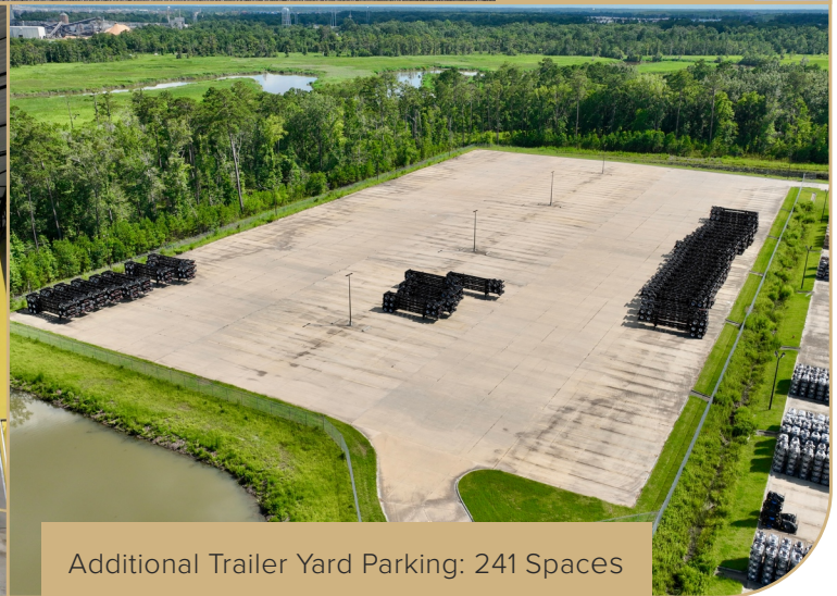
Additional Trailer Yard Parking: 241 Spaces