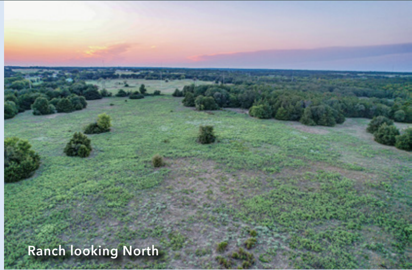
Ranch looking North