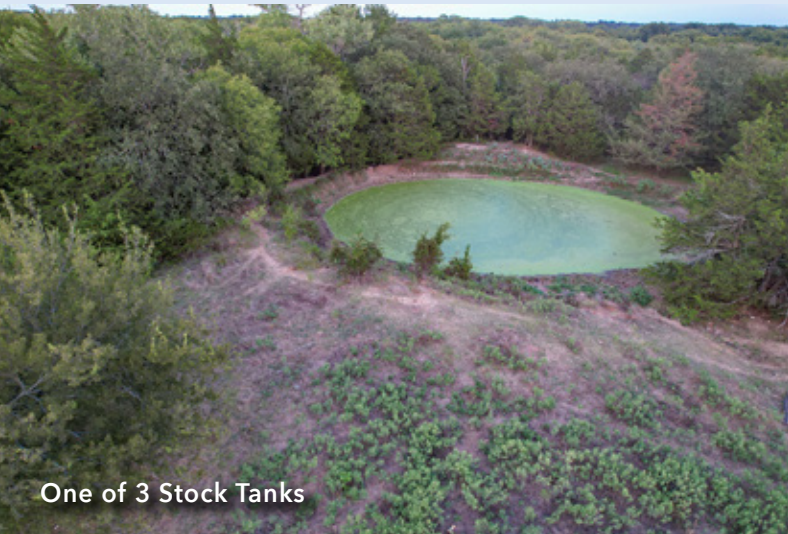
One of 3 Stock Tanks