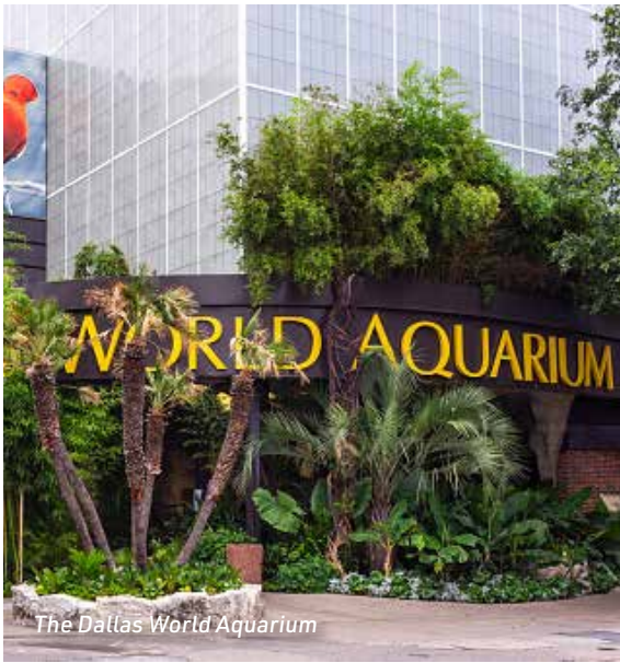
The Dallas World Aquarium