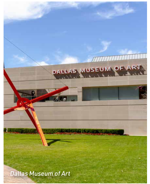
Dallas Museum of Art