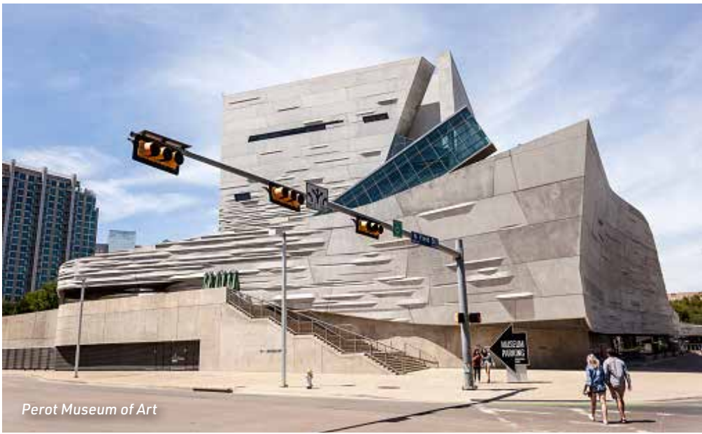
Perot Museum of Art