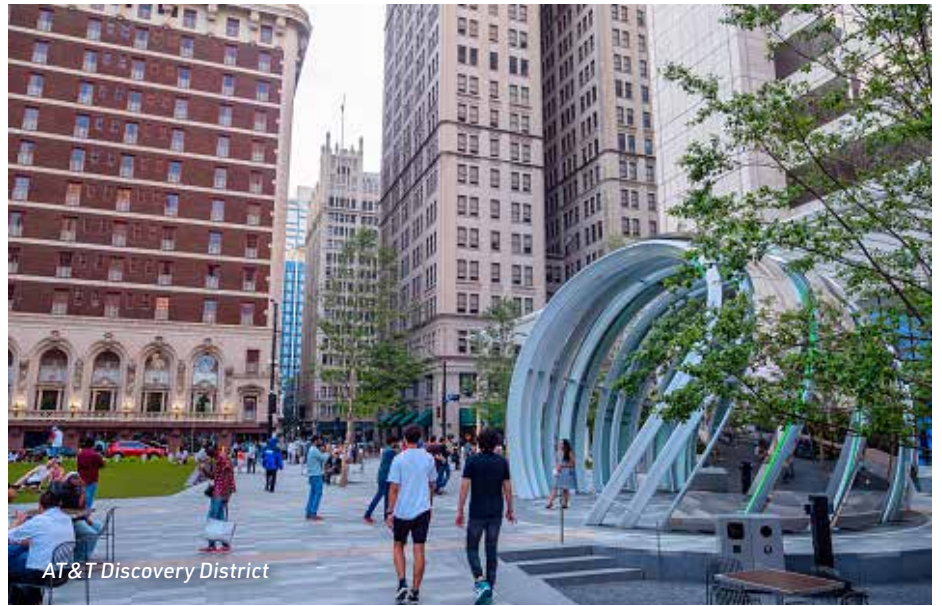
AT&T Discovery District