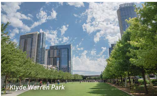
Klyde Warren Park