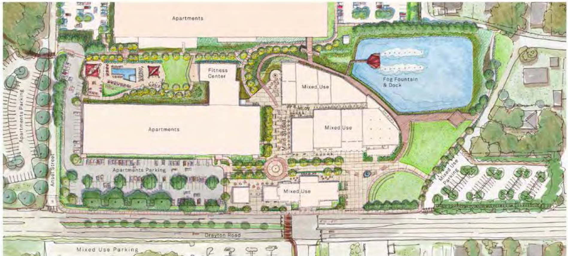
Drayton Mill Conceptual Plan