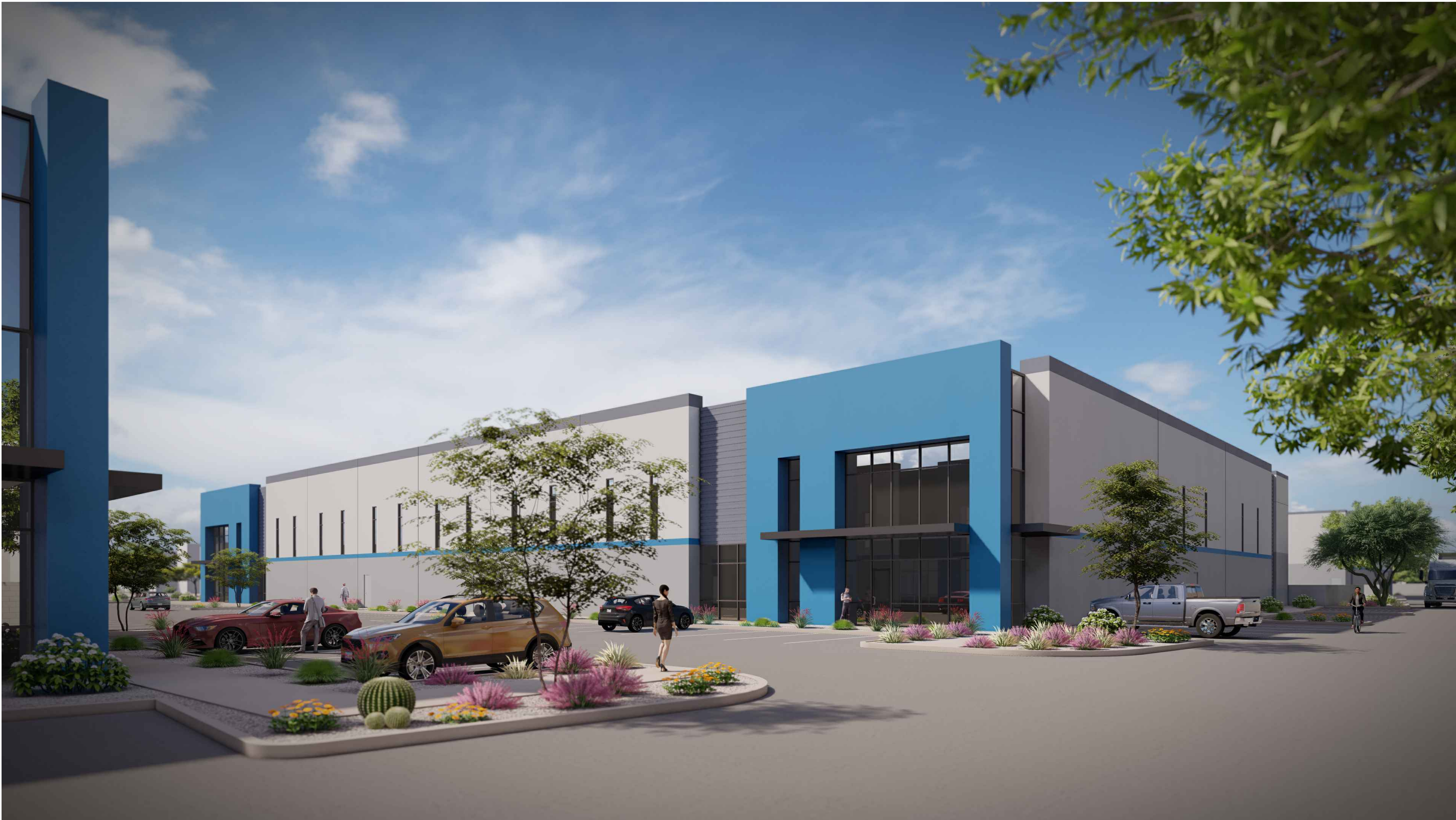
1 PERSPECTIVE RENDERING SCALE: N/A