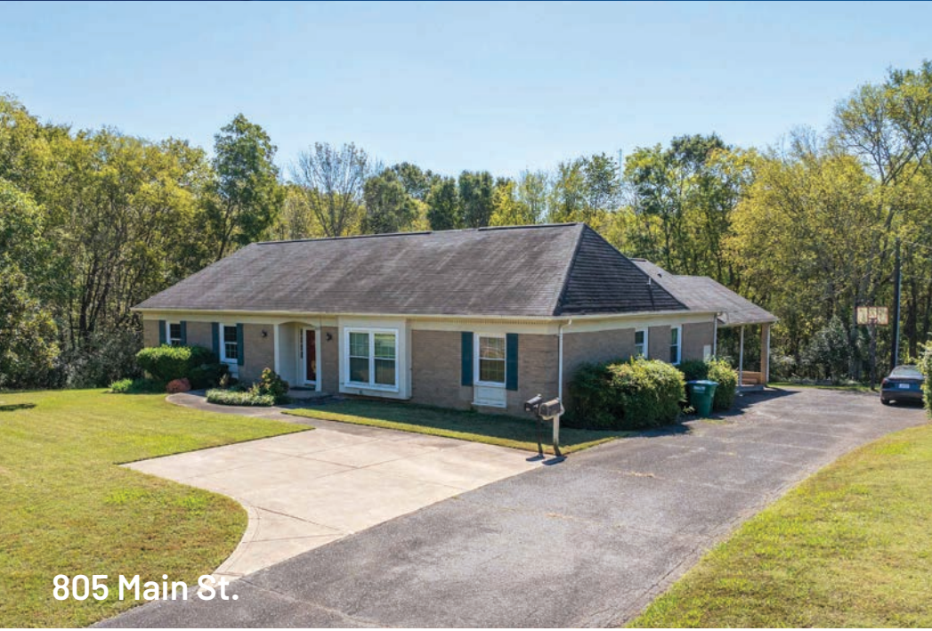
805 Main St.