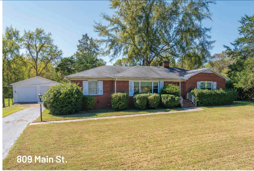
809 Main St.