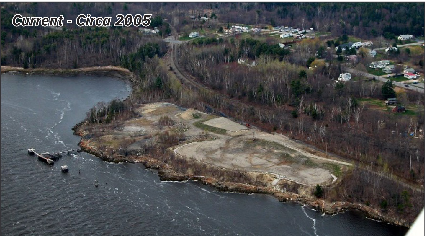
Current - Circa 2005