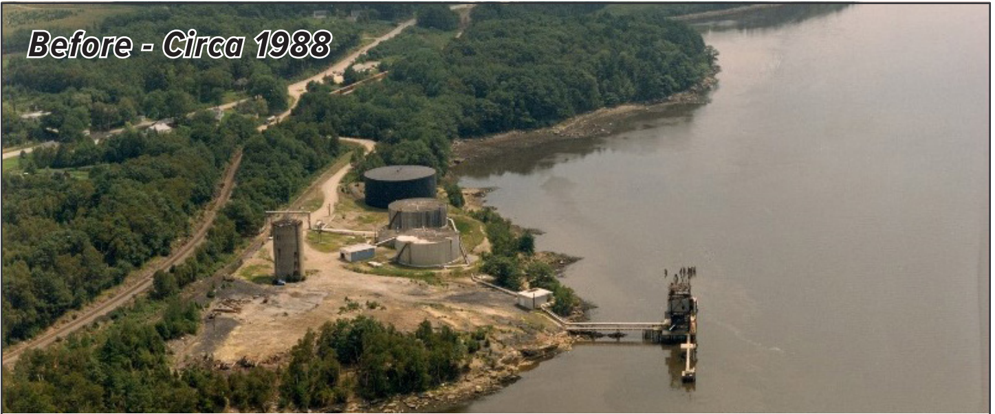
Before - Circa 1988