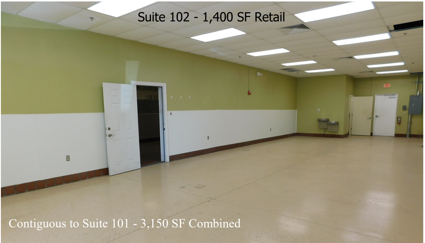
Suite 102 - 1,400 SF Retail

Contiguous to Suite 101 - 3,150 SF Combined