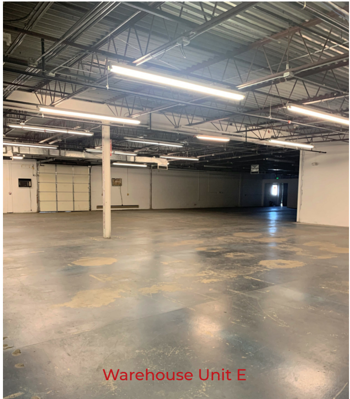
Warehouse Unit E