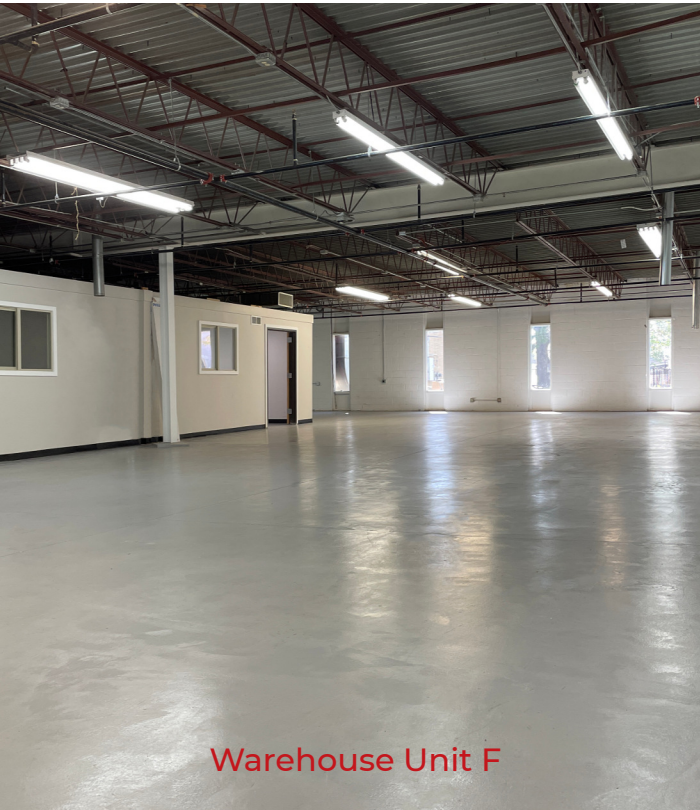
Warehouse Unit F