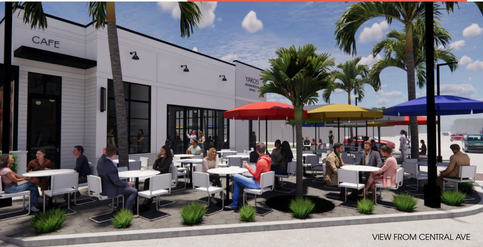
VIEW FROM CENTRAL AVE