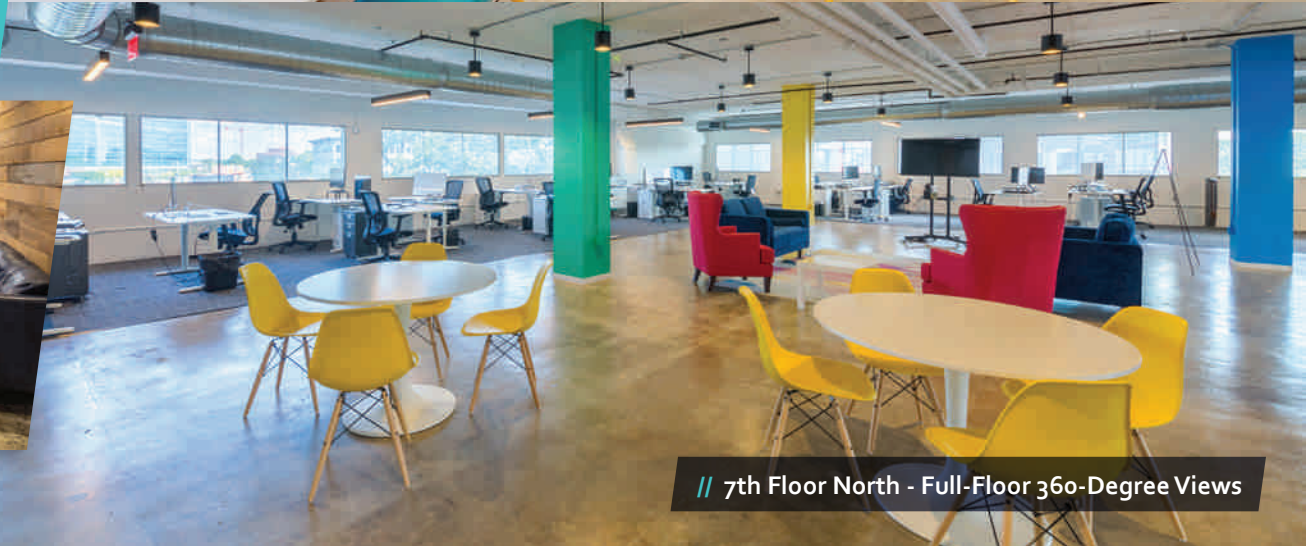
// 7th Floor North - Full-Floor 360-Degree Views