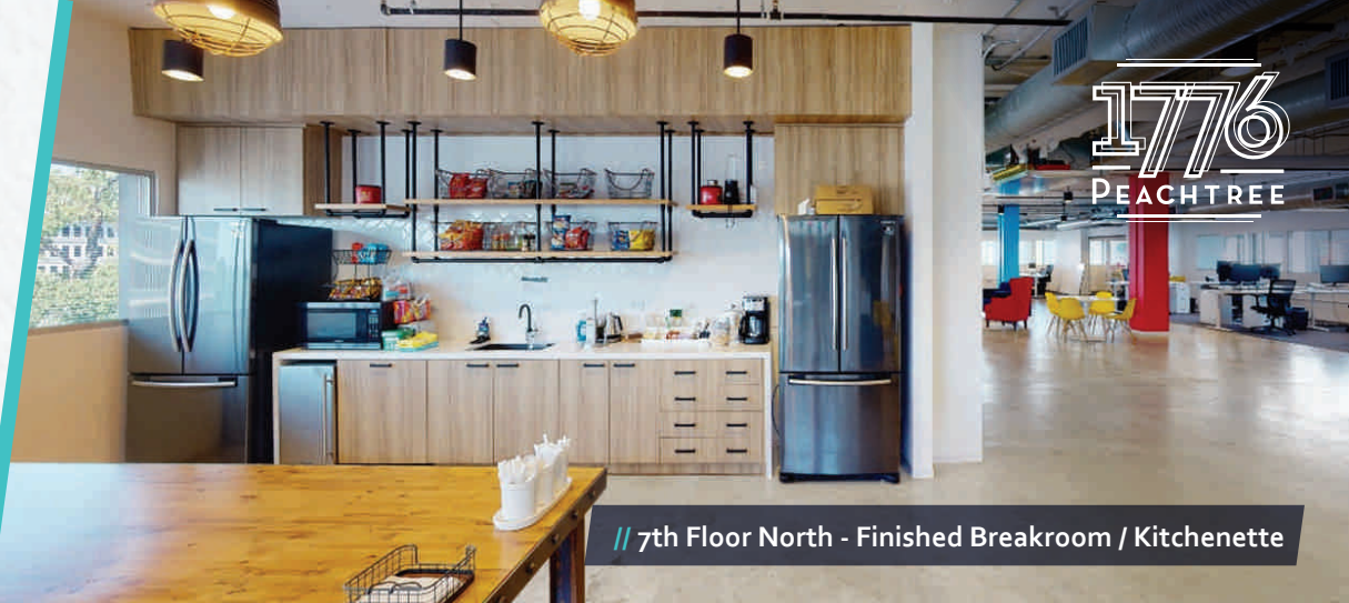
// 7th Floor North - Finished Breakroom / Kitchenette