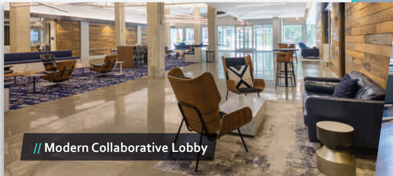
// Modern Collaborative Lobby