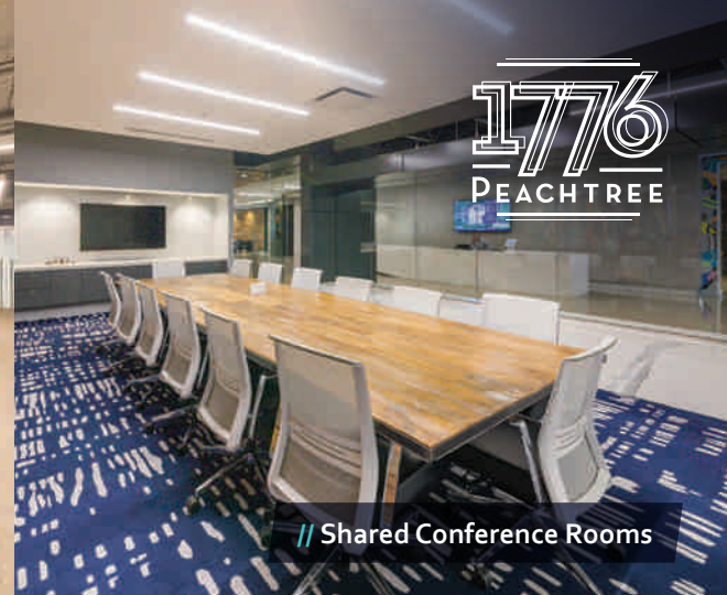
// Shared Conference Rooms