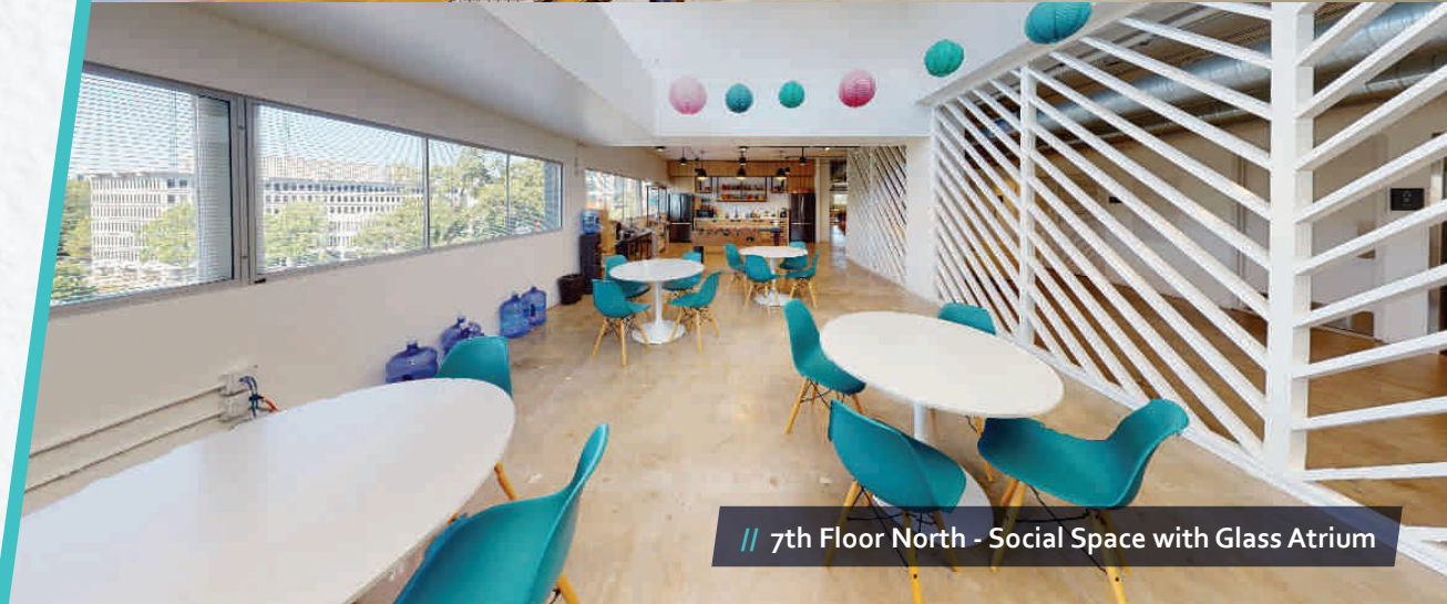
// 7th Floor North - Social Space with Glass Atrium