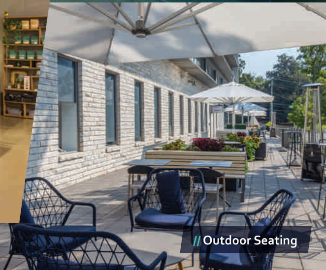
// Outdoor Seating