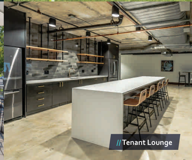
// Tenant Lounge