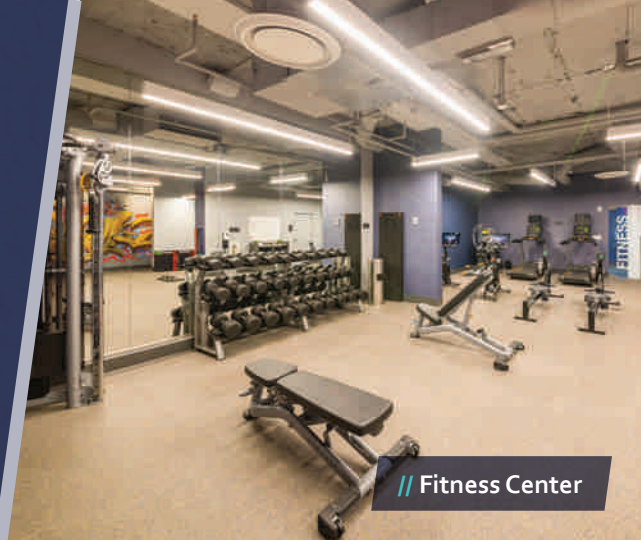
// Fitness Center