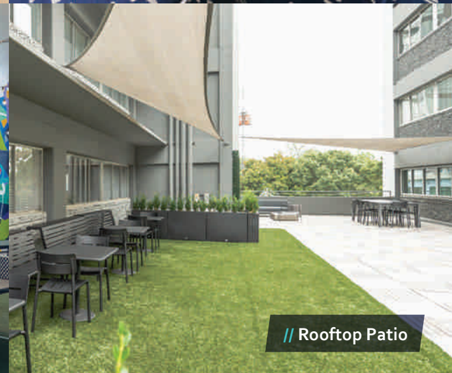
// Rooftop Patio