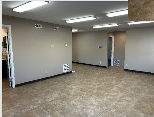
8106 South Industrial Dr.