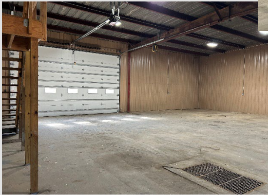
8110 South Industrial Dr.