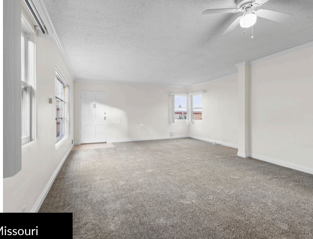
1521 Missouri (Detached House)