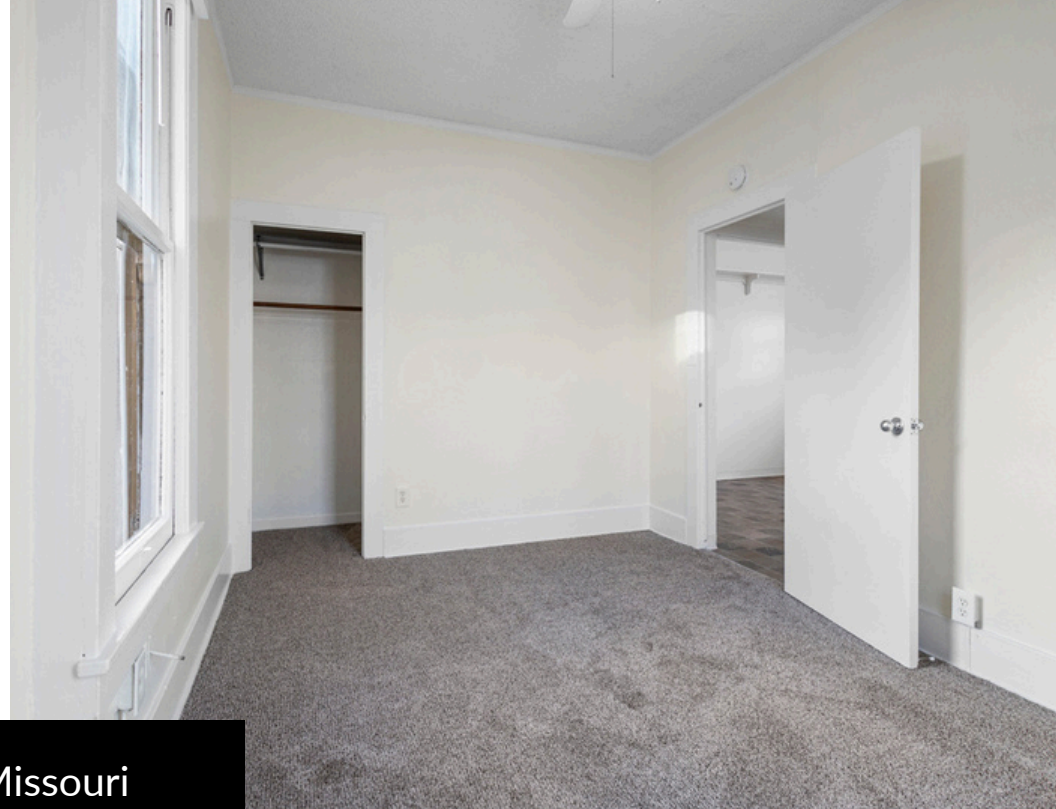
1521 Missouri (Detached House)