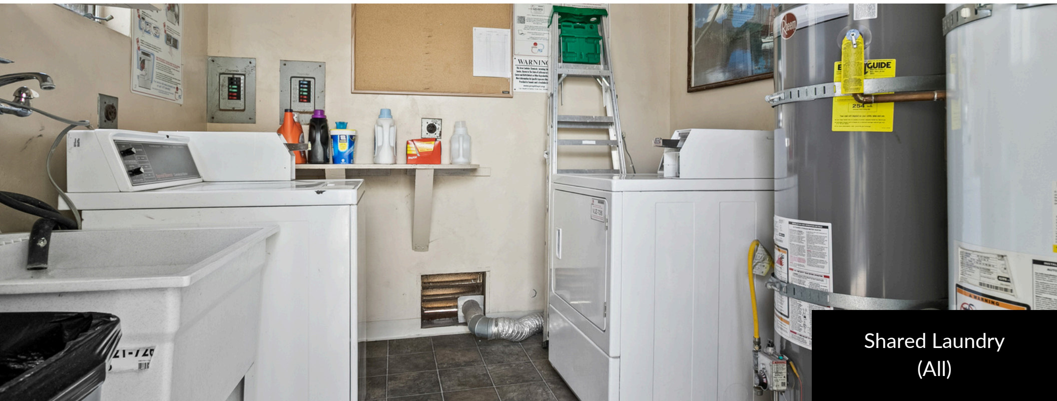
Shared Laundry (All)