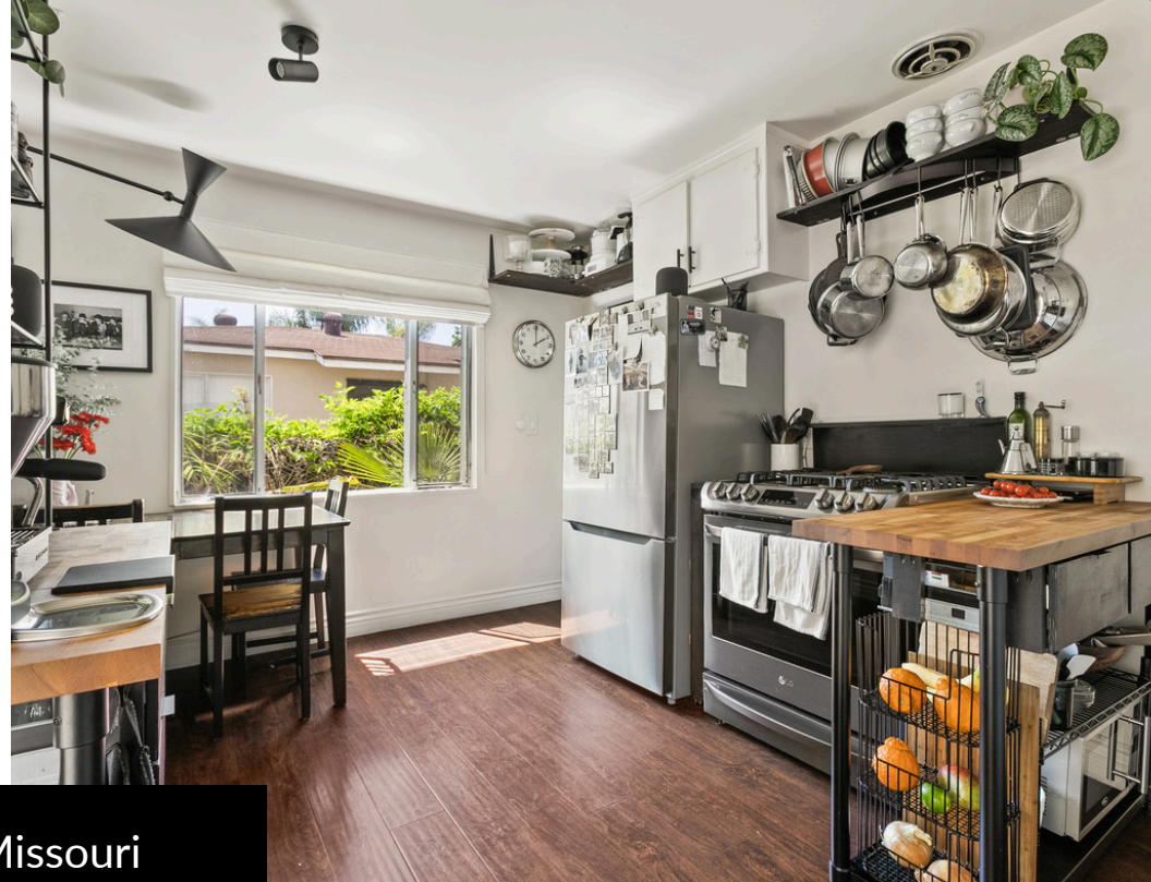
1519 Missouri (Front Downstairs)