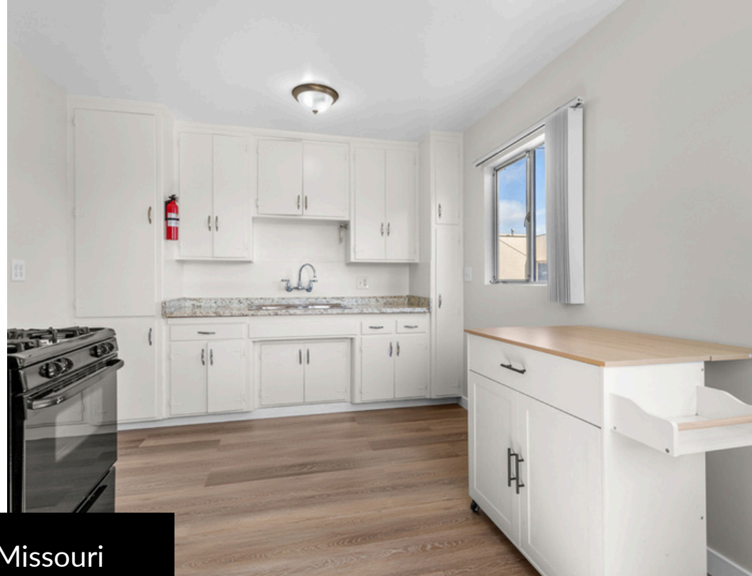
1519.5 Missouri (Front Upstairs)