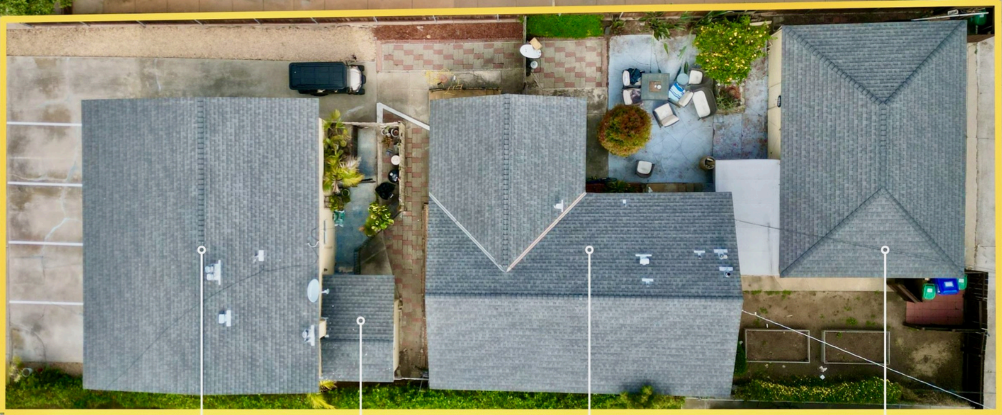
1519 & 1519.5 Missouri 2x 2BR/1BA Apartments