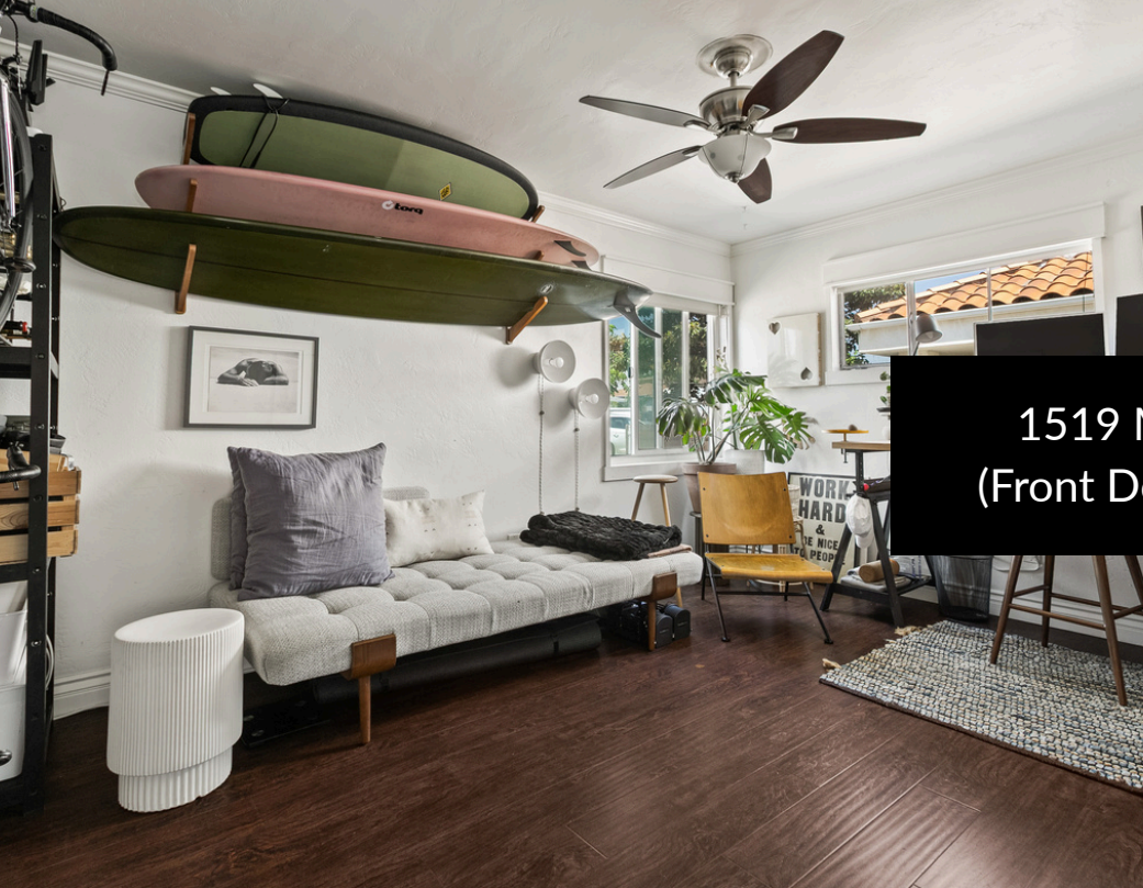
1519 Missouri (Front Downstairs)