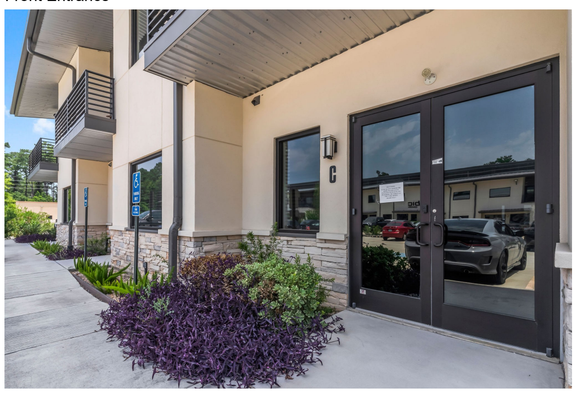
Unit D&E - 5.200 sf - Front Entrance