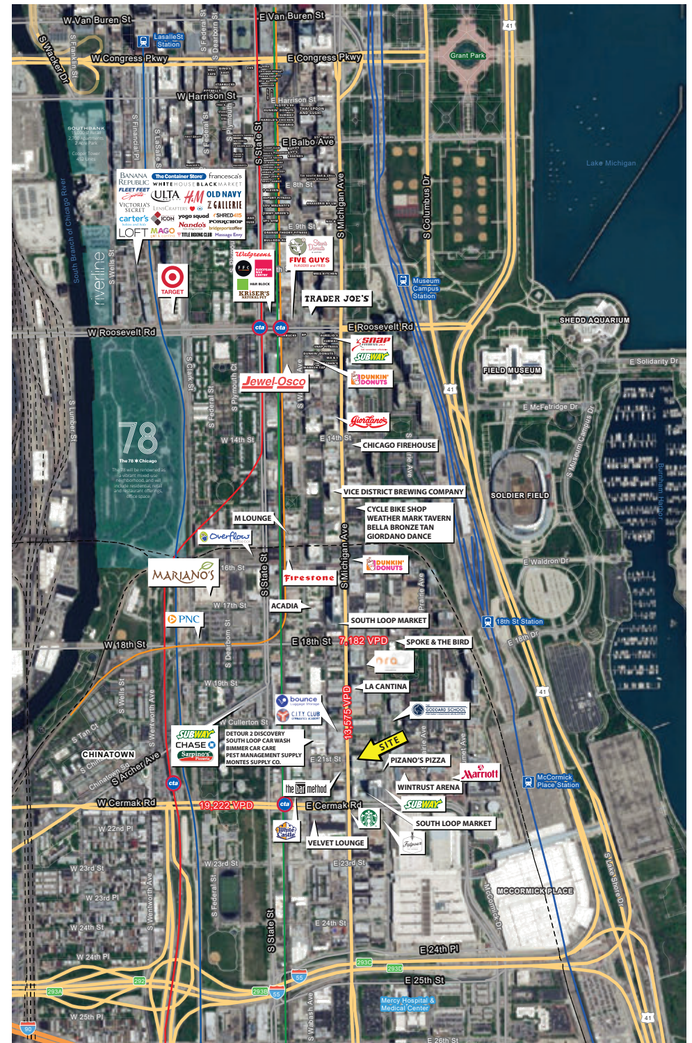
2111 S MICHIGAN AVE, CHICAGO, ILLINOIS