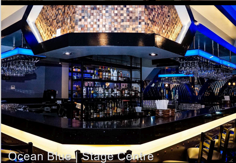
Ocean Blue | Stage Centre