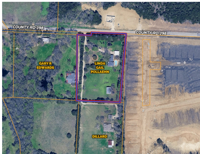
CONTOUR LINES MAP