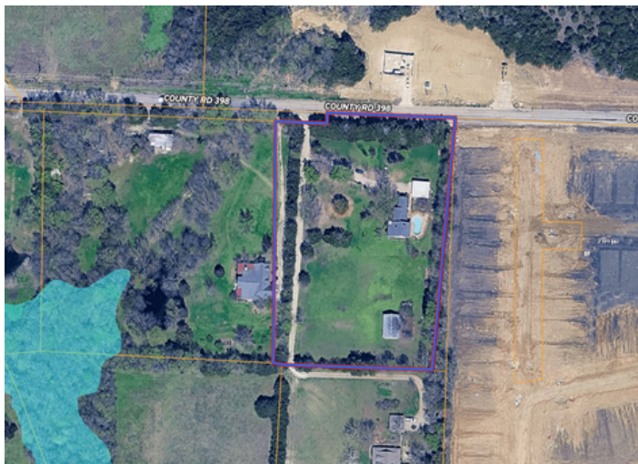
FEMA FLOOD MAP