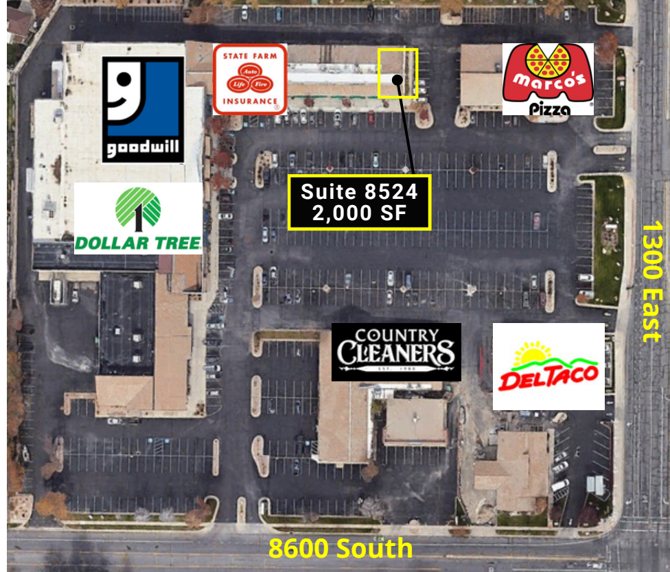
Suite 8524: 2,000 SF