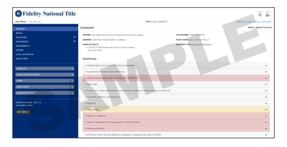
Effortless, Efficient, Compliant, and Accessible

To view your new Fidelity National Title First Alert powered by <u>LiveLOOK report, Click Here</u>