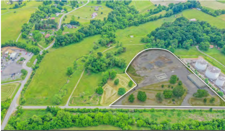
7± ACRES 7,200 SF OFFICE / WAREHOUSE

1371 OIL TERMINAL RD BLUE RIDGE, VA 24064