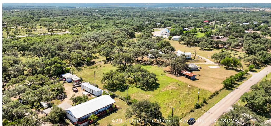
429 Jefferson Street, Kerrville, TX 78028