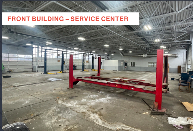
FRONT BUILDING - SERVICE CENTER