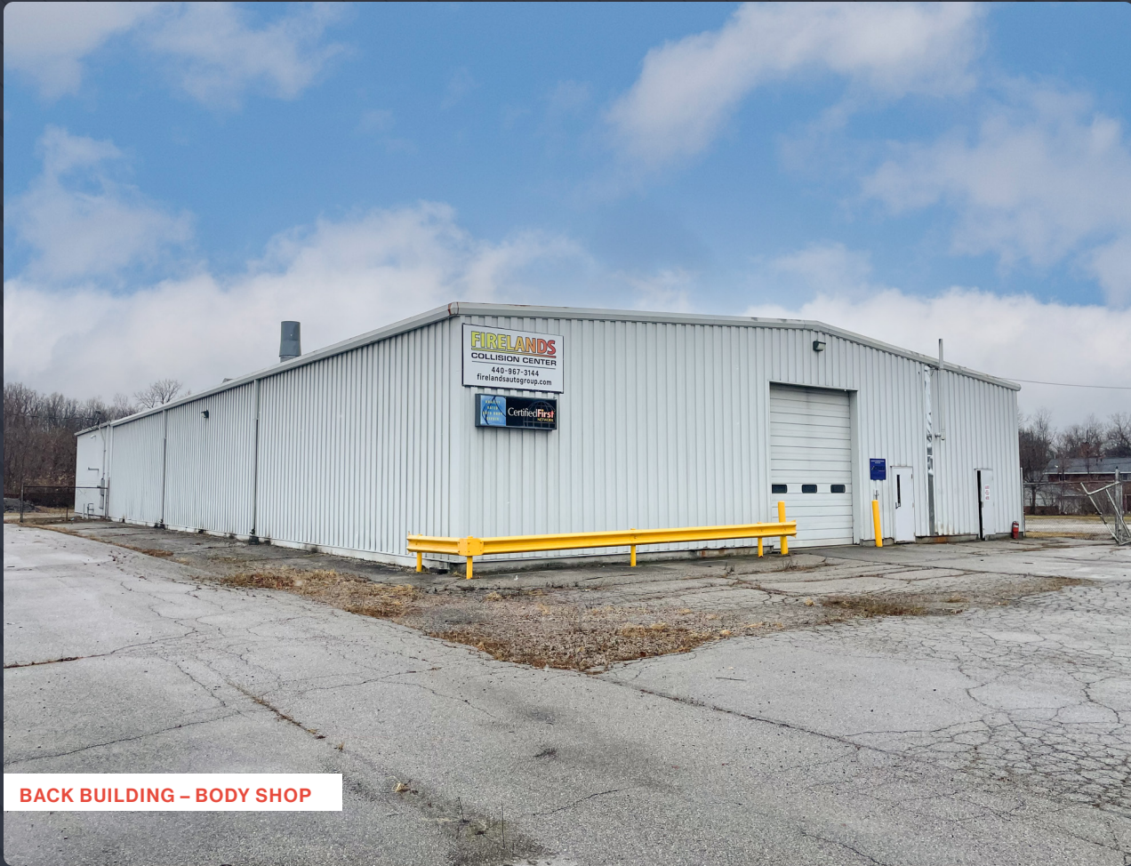
BACK BUILDING - BODY SHOP