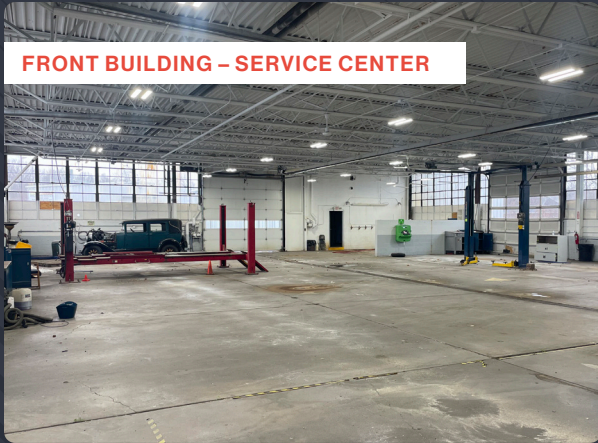
FRONT BUILDING - SERVICE CENTER