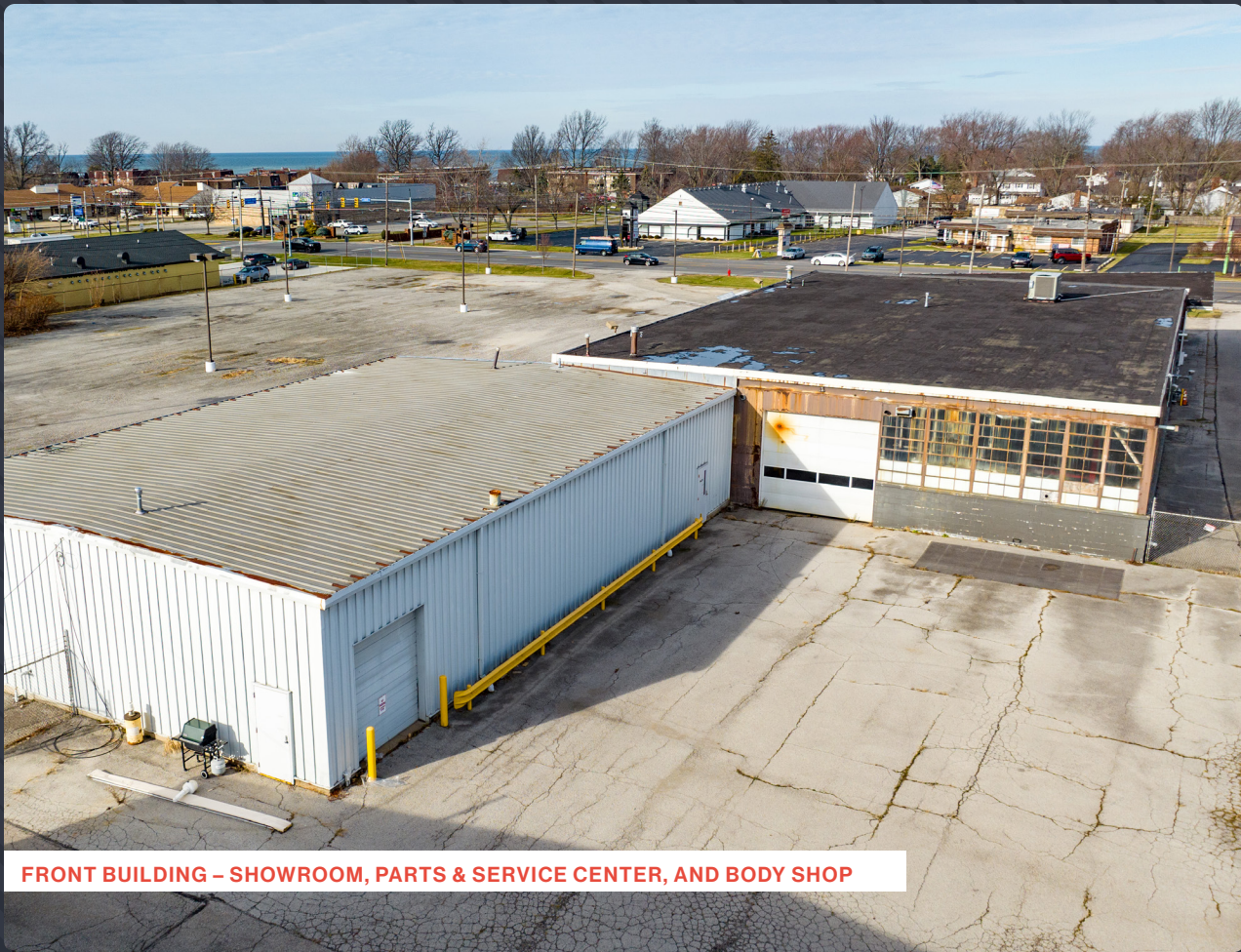
FRONT BUILDING - SHOWROOM, PARTS & SERVICE CENTER, AND BODY SHOP