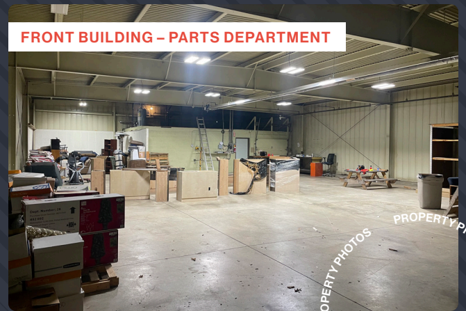
FRONT BUILDING - PARTS DEPARTMENT