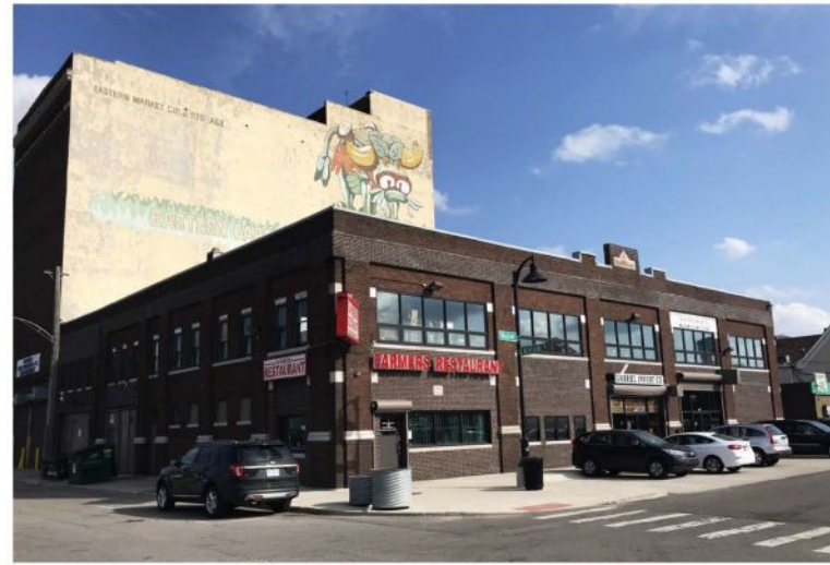
1468 ADELAIDE SOLD AT $150/SF