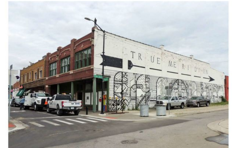
2700 ORLEANS SOLD AT $123/SF