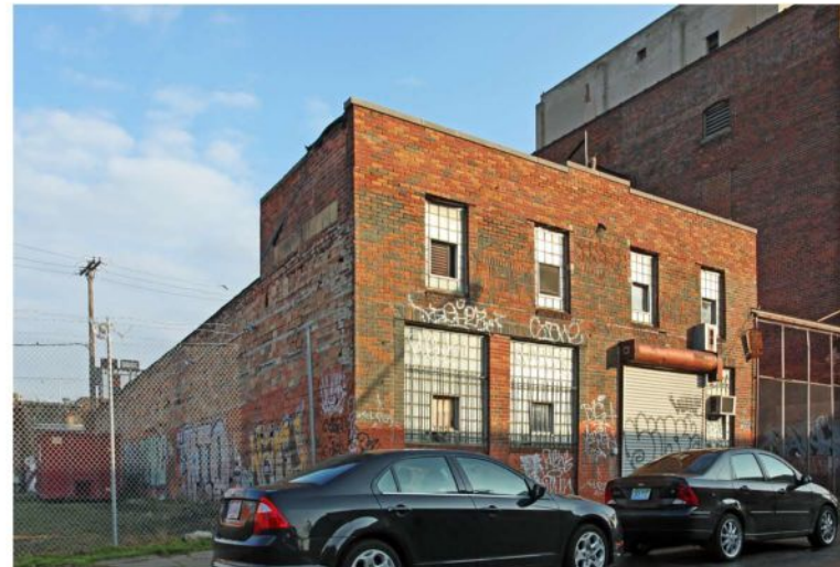
1533 WINDER OFFERED AT $141