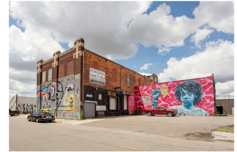
1561 ADELAIDE SOLD AT $147/SF