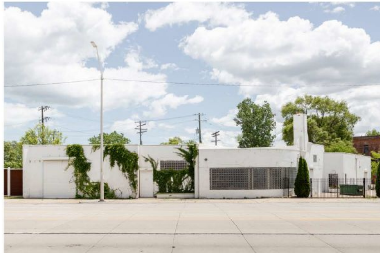
2930 GRATIOT SOLD AT $149/SF