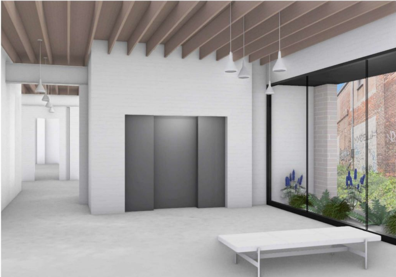
CONCEPTUAL NORTH ELEVATION & ELEVATOR PLANS