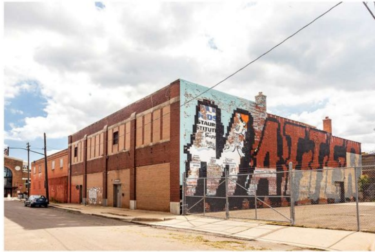
1350 & 1328 DIVISION OFFERED AT $98/SF