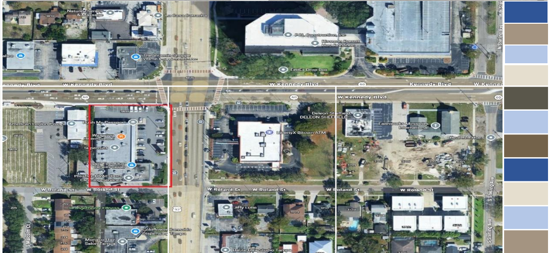
Prime location just south of 275