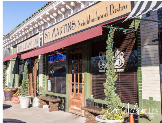
4223 Bryan Street

Dallas' true authentic Italian food and wine store. Voted best "Italian Sub" and "Muffuletta" by the Dallas Observer.