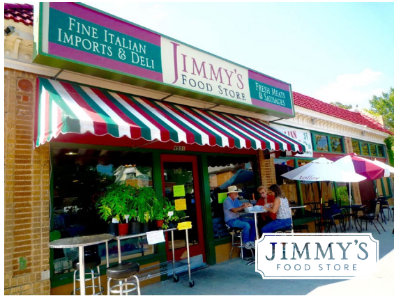
4901 Bryan Street

Dynamic Location | defined by history, charm and living at the beat of its own rhythm, Old East Dallas is one-of-a-kind. These funky streets hold historic homes, dive bars, outstanding gastronomy and farm-to-table food.