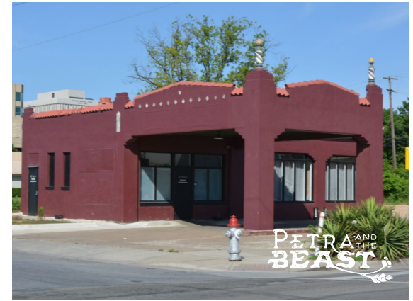
601 N. Haskell Avenue

Petra and the Beast flows with the natural seasons to bring unique, pleasant and hearty reflections from far, forage, fermentation and fire to the table. We proudly source from our local farmers, focusing on sustainability.