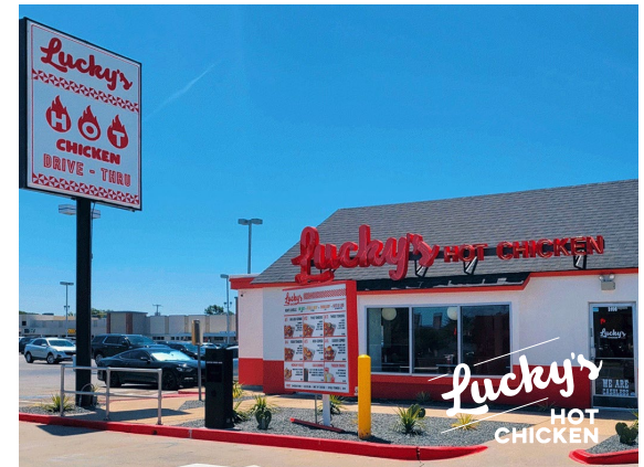
4505 Gaston Avenue

Urbano Cafe is a cozy American | Italian bistro to enjoy delicious food, live entertainment, wine pairing dinners, wine tastings and pop-ups by local vendors.