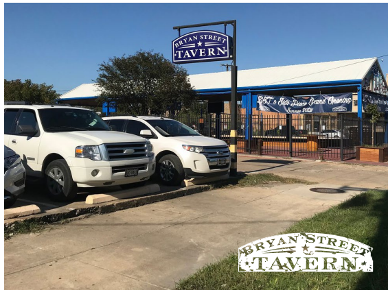
4315 Bryan Street

Petra and the Beast flows with the natural seasons to bring unique, pleasant and hearty reflections from far, forage, fermentation and fire to the table. We proudly source from our local farmers, focusing on sustainability.