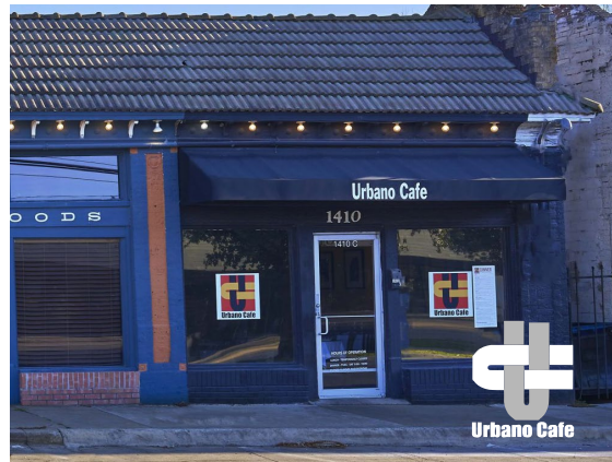
1410 N. Fitzhugh Avenue

Bryan Street Tavern has one of Dallas' best known patios with exceptional pizza, beers on tap and a giant projector, making it a one-of-a-kind sports bar.