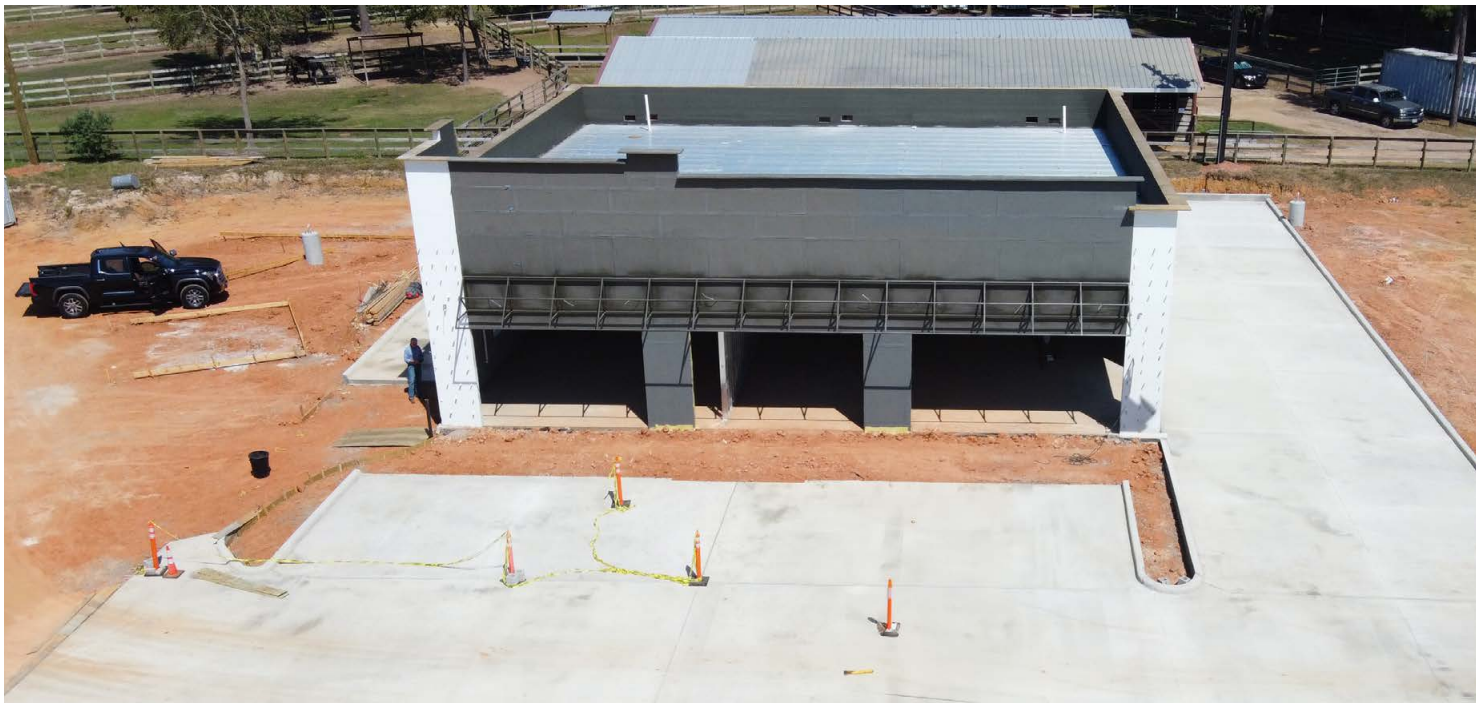
Construction Progression Oct 2024

Lorenzo Neal lneal@resolutre.com 281.445.0033