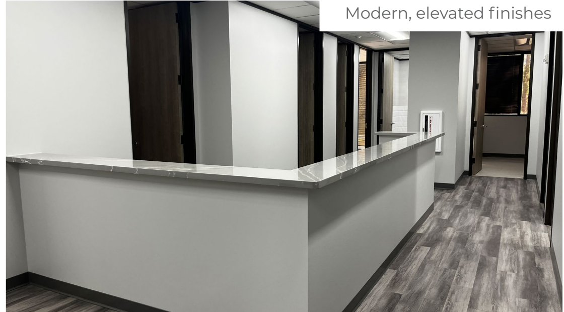
Modern, elevated finishes