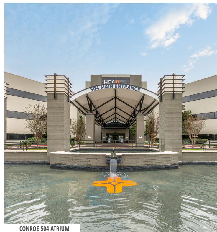
CONROE 504 ATRIUM