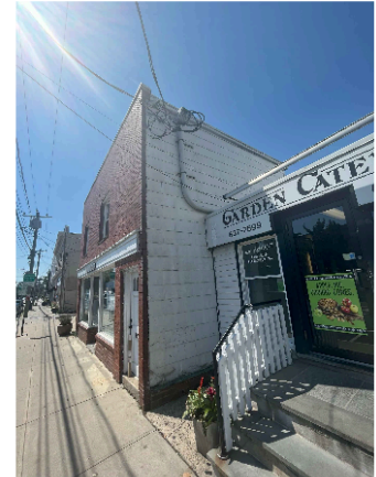
C PART. NORTH ELEVATION SCALE: 1/4" = 1'-0"