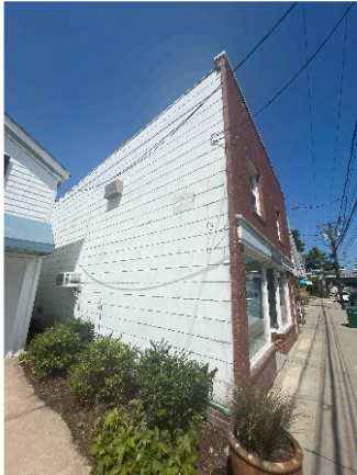
A PART. SOUTH ELEVATION SCALE: 1/4" = 1'-0"