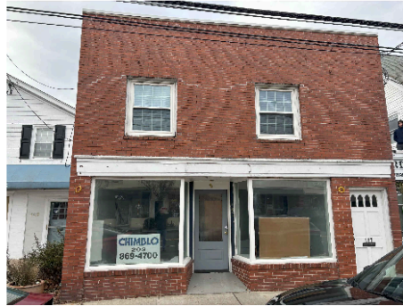
B EAST (S. B. AVENUE) ELEVATION SCALE: 1/4" = 1'-0"