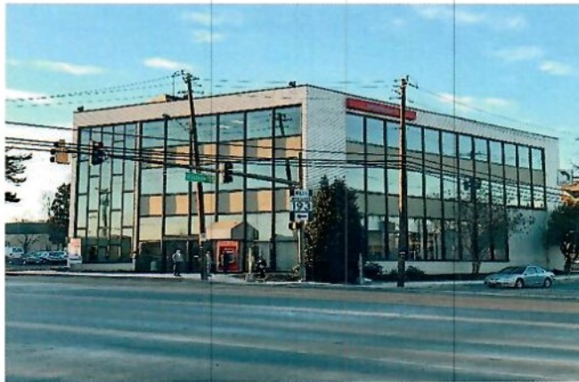
Remodeled "Bank of America Building" on University Blvd.