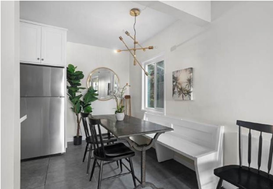
Unit C interior - dining nook