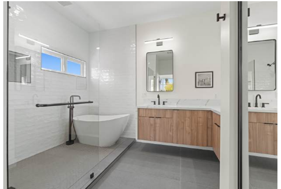
Unit A interior - primary bathroom