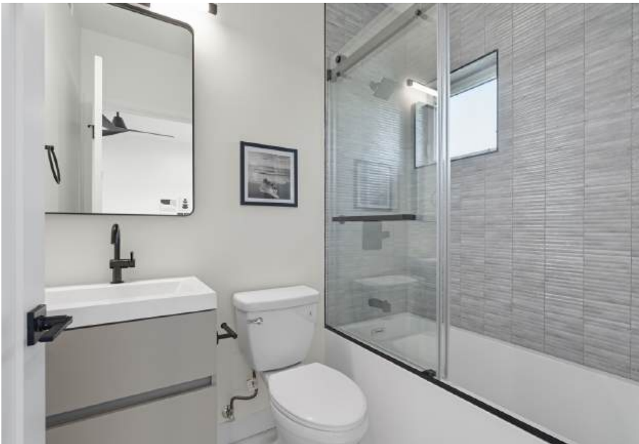
Unit B interior - remodeled bathroom