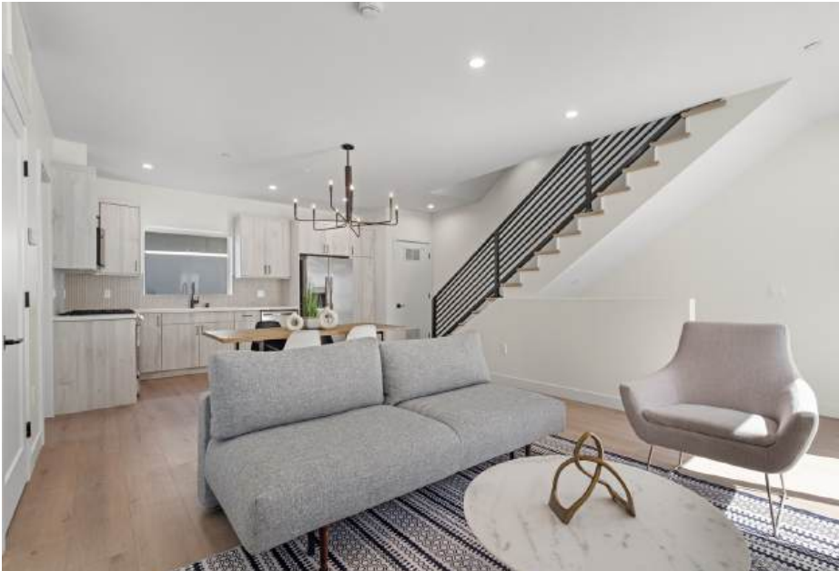
Unit B interior - open living space