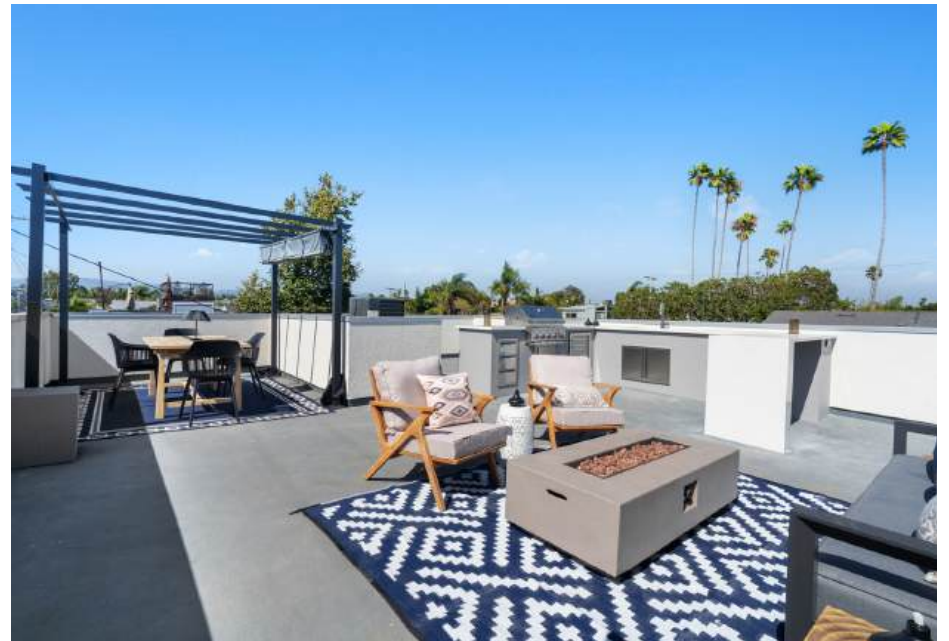
Unit B exterior - rooftop deck