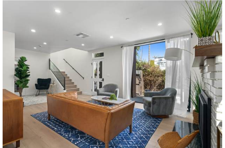
Unit A interior - living room