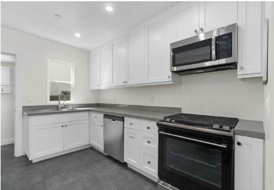
Unit A interior - kitchen