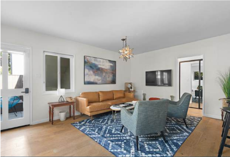
Unit C interior - open living space