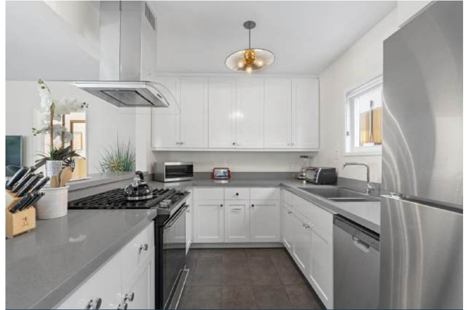
Unit C interior - remodeled kitchen