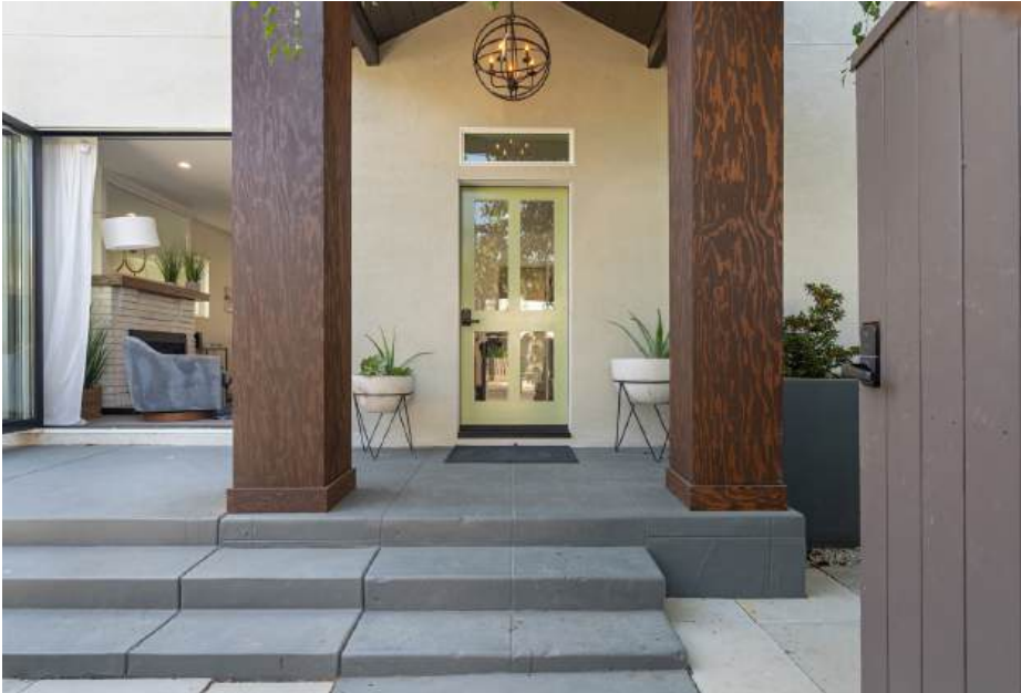
Unit A exterior - entry