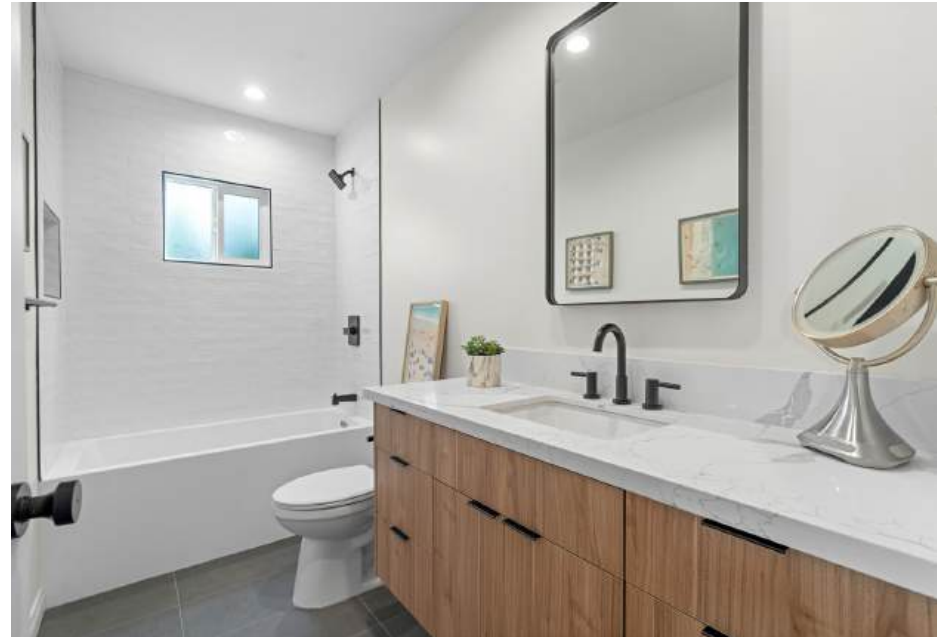
Unit C interior - remodeled bathroom