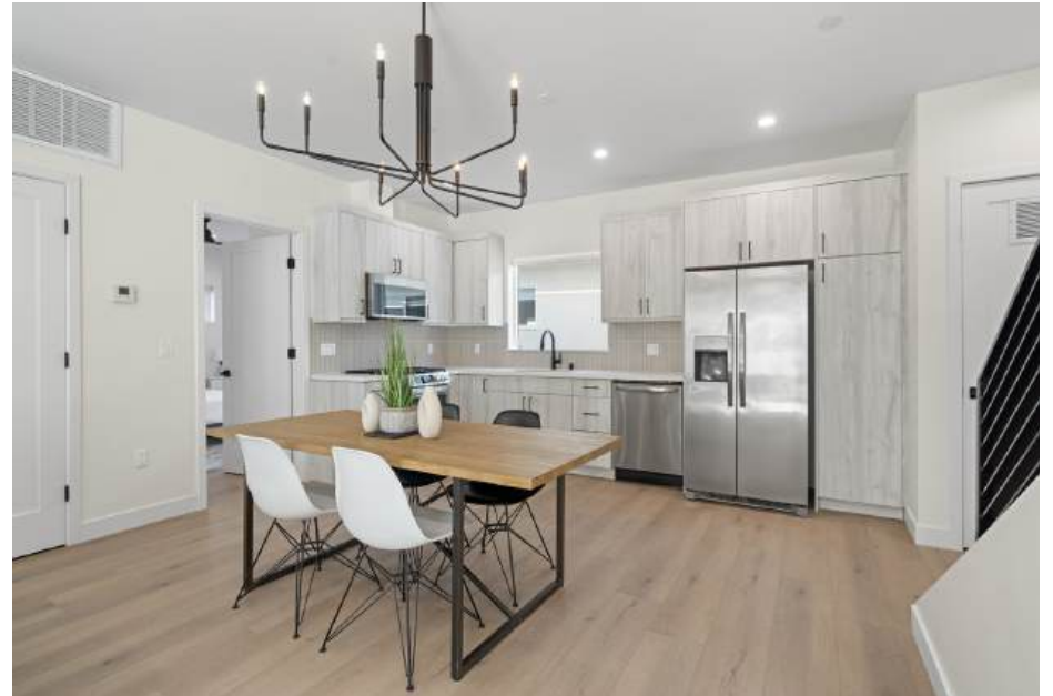
Unit B interior - kitchen/dining room