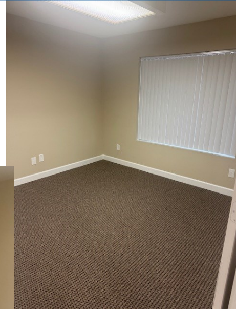
Left Rear Office