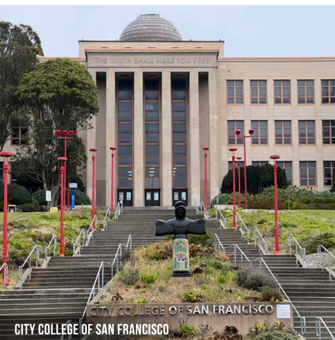
CITY COLLEGE OF SAN FRANCISCO