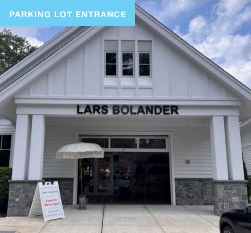
PARKING LOT ENTRANCE