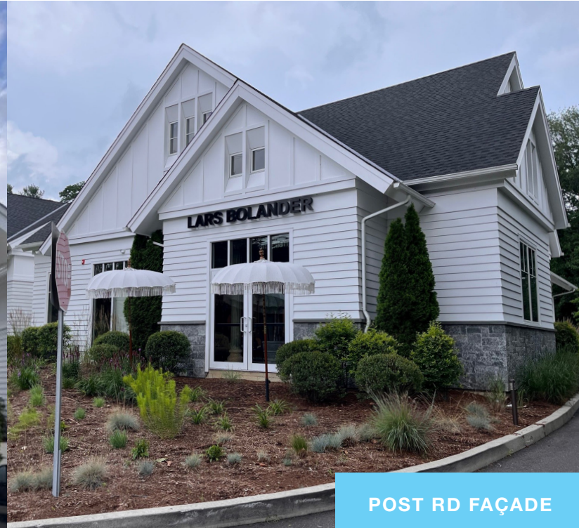
POST RD FAÇADE