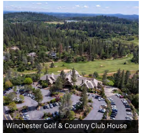
Winchester Golf & Country Club House