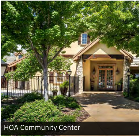
HOA Community Center