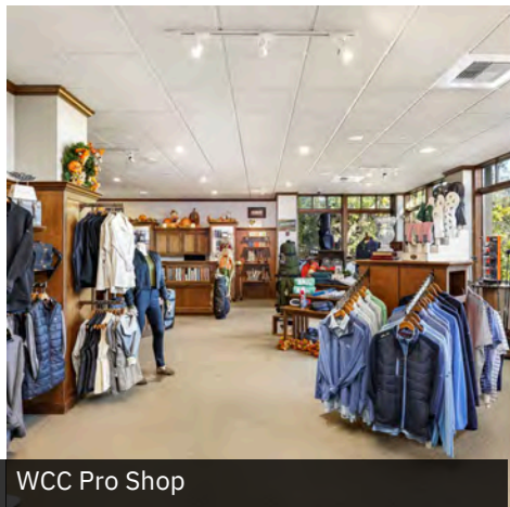
WCC Pro Shop