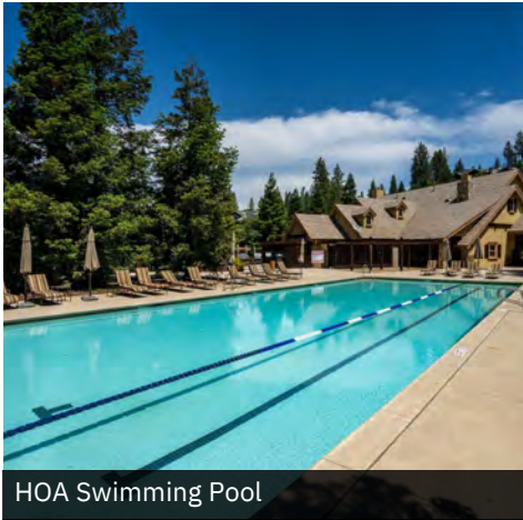
HOA Swimming Pool