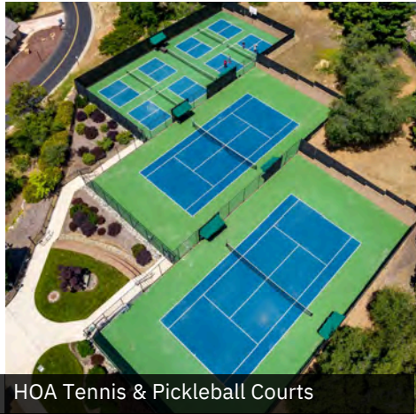
HOA Tennis & Pickleball Courts