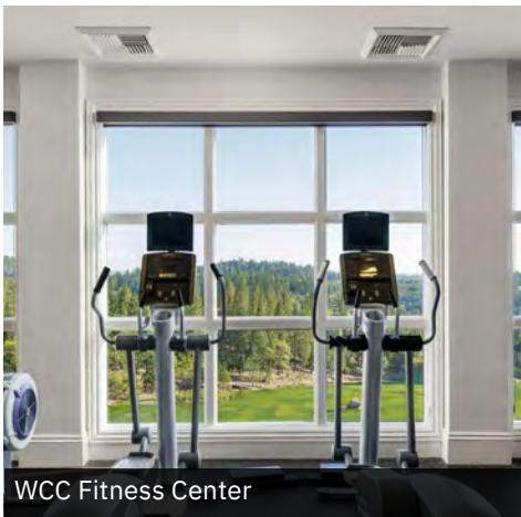
WCC Fitness Center