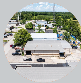
LOADING DOCK AND ROLL-UP DRIVE-IN