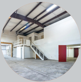
LARGE INDUSTRIAL WAREHOUSE SPACE