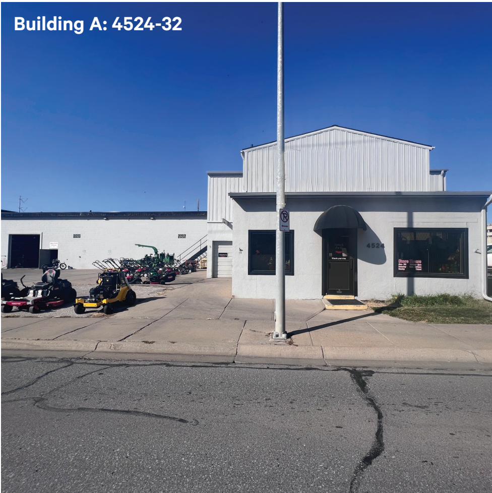
Building A: 4524-32