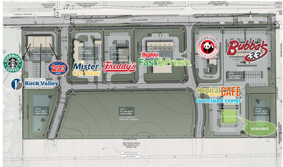
Birchwood South First Addition Site Plan