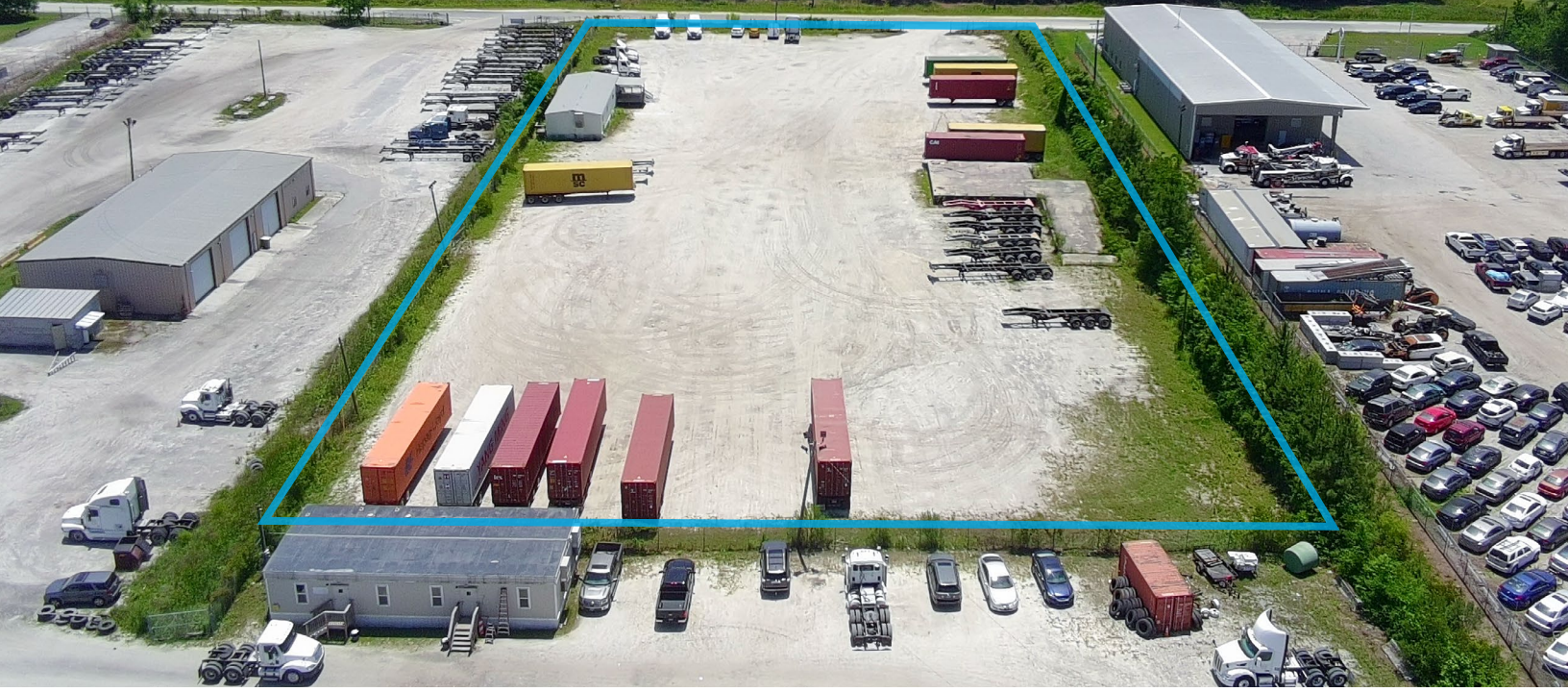
Yard B: ±5.00 AC Yard