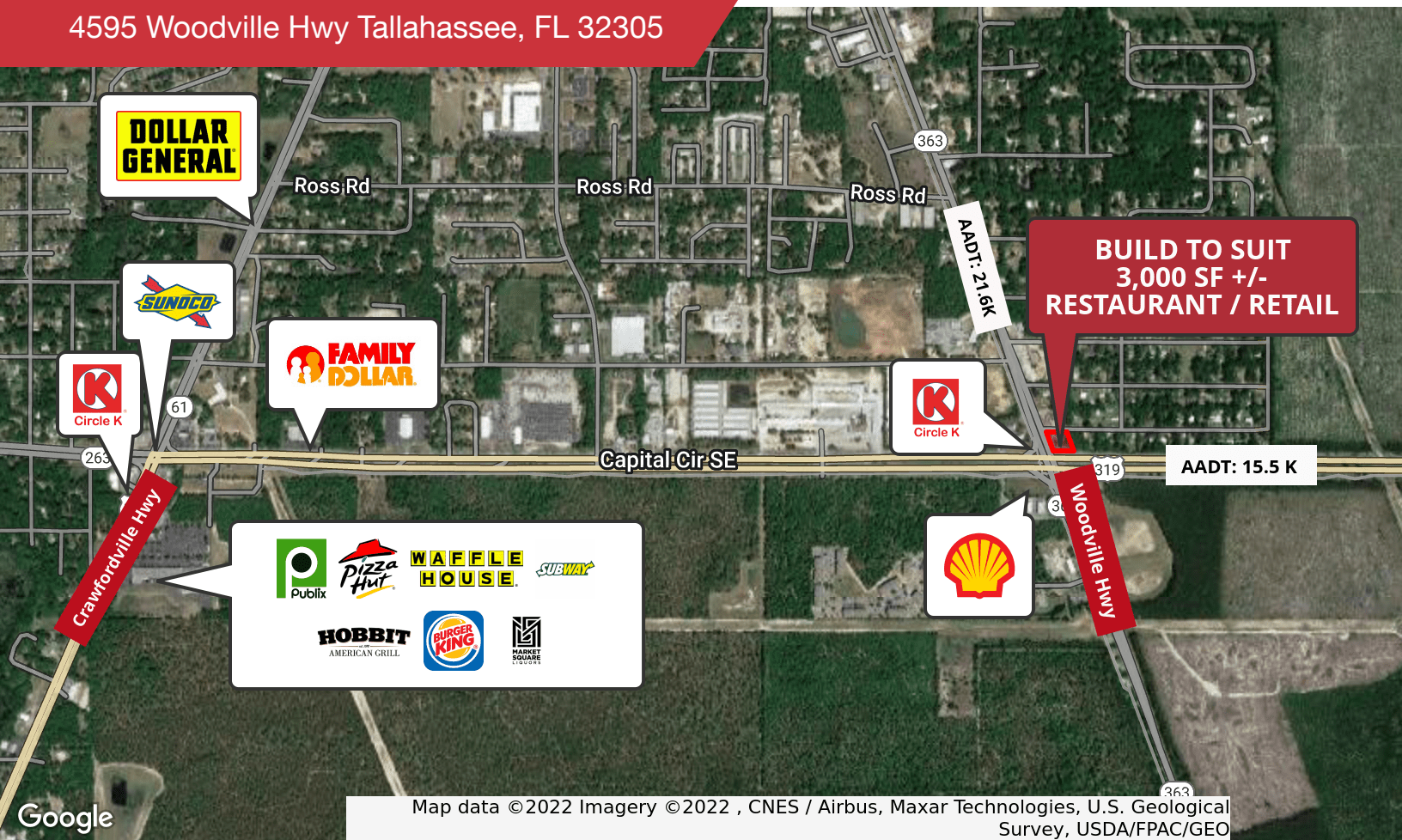
Map data ©2022 Imagery ©2022 , CNES / Airbus, Maxar Technologies, U.S. Geological Survey, USDA/FPAC/GEO

4595 Woodville Hwy Tallahassee, FL 32305