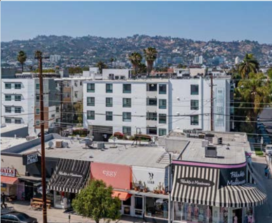
THE LITTLE DOOR

The 3rd Street Corridor in the West Hollywood/Mid-City area is a dynamic blend of upscale urban living and local culture. Renowned for its boutique shopping, artisanal dining options, and thriving independent businesses, this vibrant stretch reflects the essence of Los Angeles sophistication. Situated between the Beverly Center and The Grove, 3rd Street combines high-end retail with a neighborhood ambiance, making it a premier destination for discerning residents and visitors alike. Whether for shopping, dining, or simply exploring, 3rd Street stands out as a key commercial and cultural hub in the city.