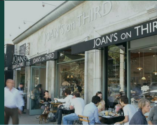
JOAN'S ON THIRD