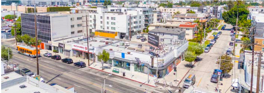
8407 W 3RD