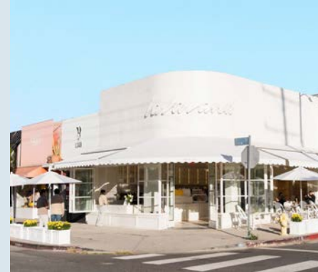
LA LA LAND CAFE

The 3rd Street Corridor in the West Hollywood/Mid-City area is a dynamic blend of upscale urban living and local culture. Renowned for its boutique shopping, artisanal dining options, and thriving independent businesses, this vibrant stretch reflects the essence of Los Angeles sophistication. Situated between the Beverly Center and The Grove, 3rd Street combines high-end retail with a neighborhood ambiance, making it a premier destination for discerning residents and visitors alike. Whether for shopping, dining, or simply exploring, 3rd Street stands out as a key commercial and cultural hub in the city.