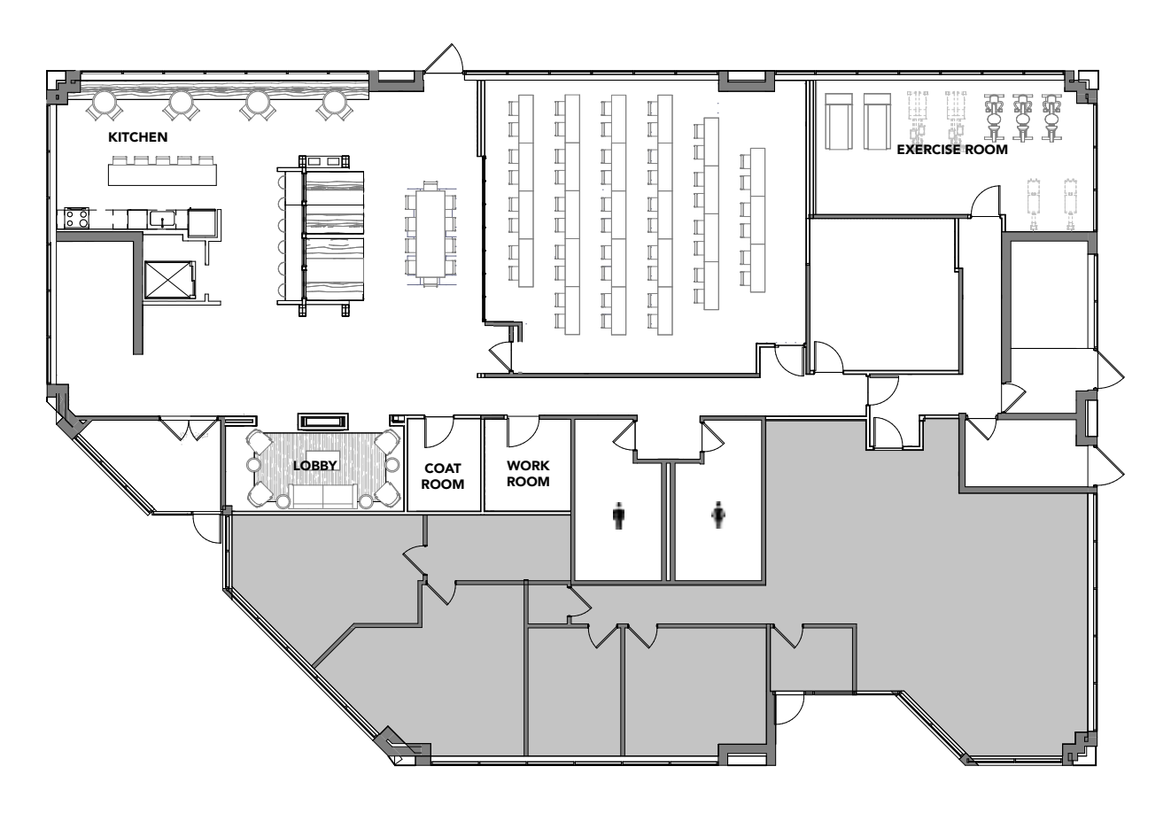
SUITE 101 2,200 SF