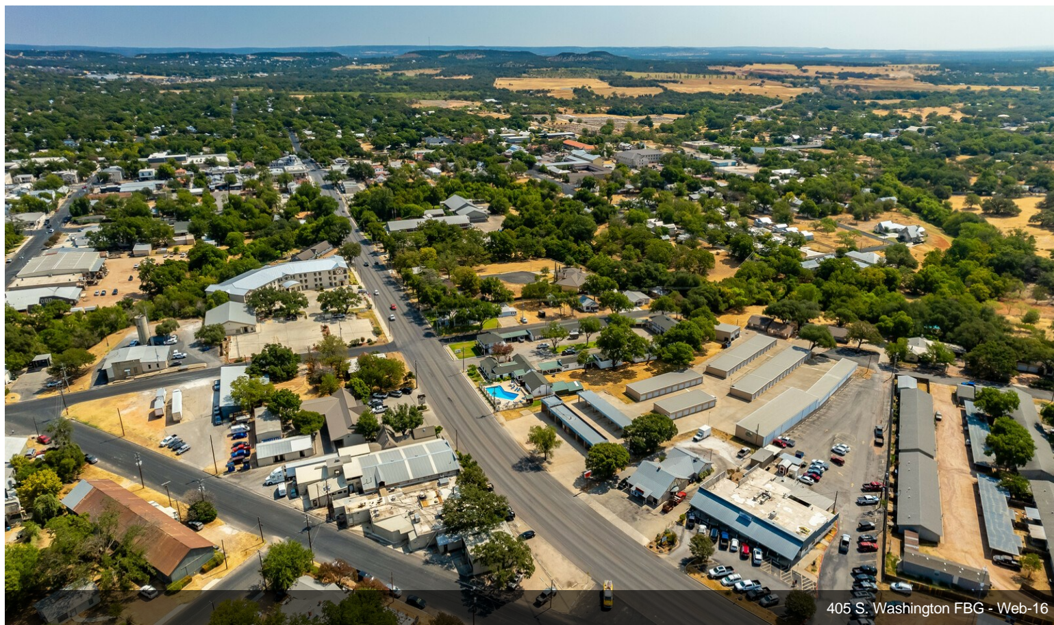
405 S. Washington FBG - Web-16