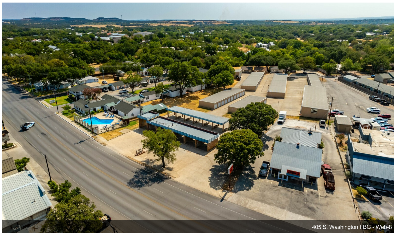
405 S. Washington FBG - Web-8