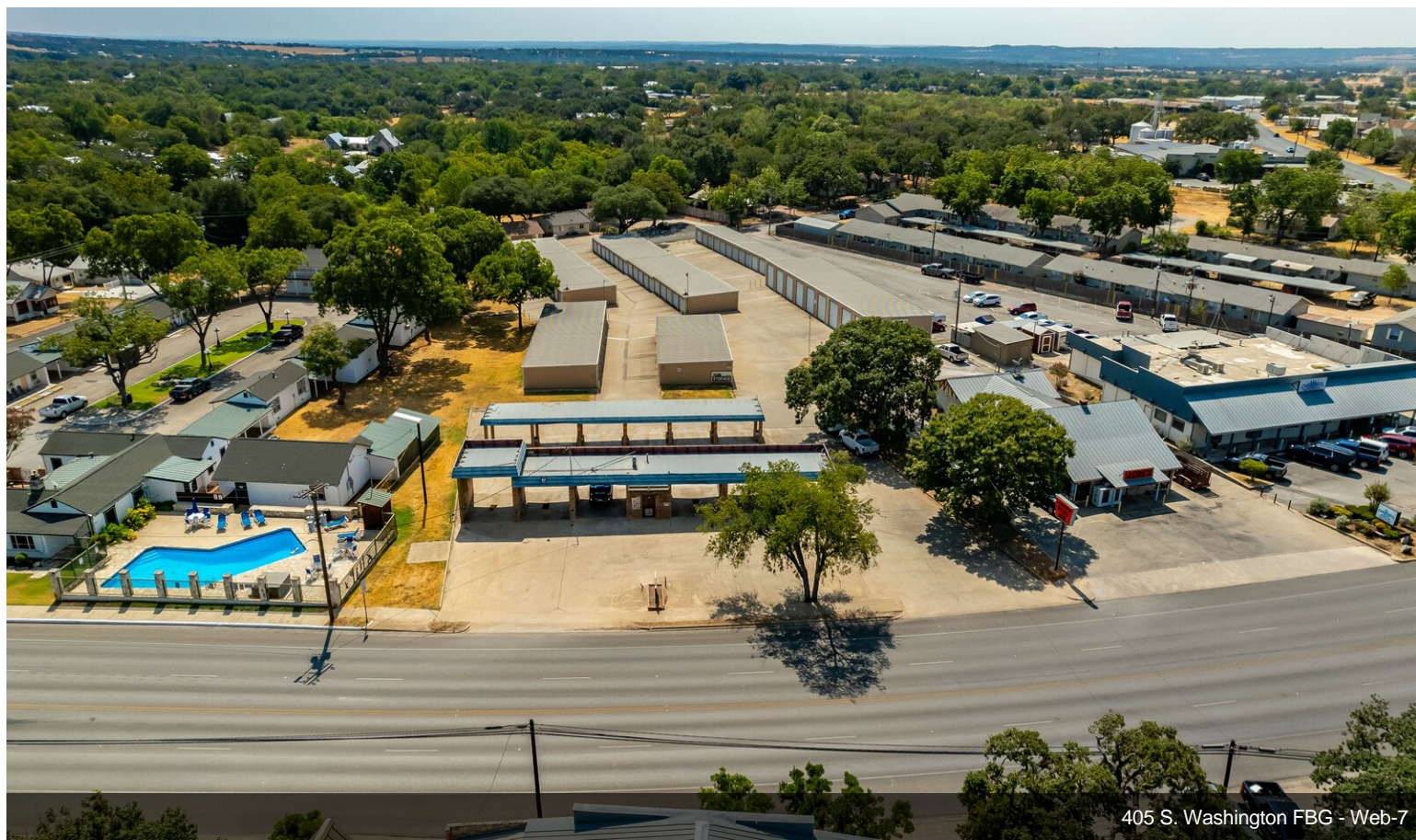
405 S. Washington FBG - Web-7