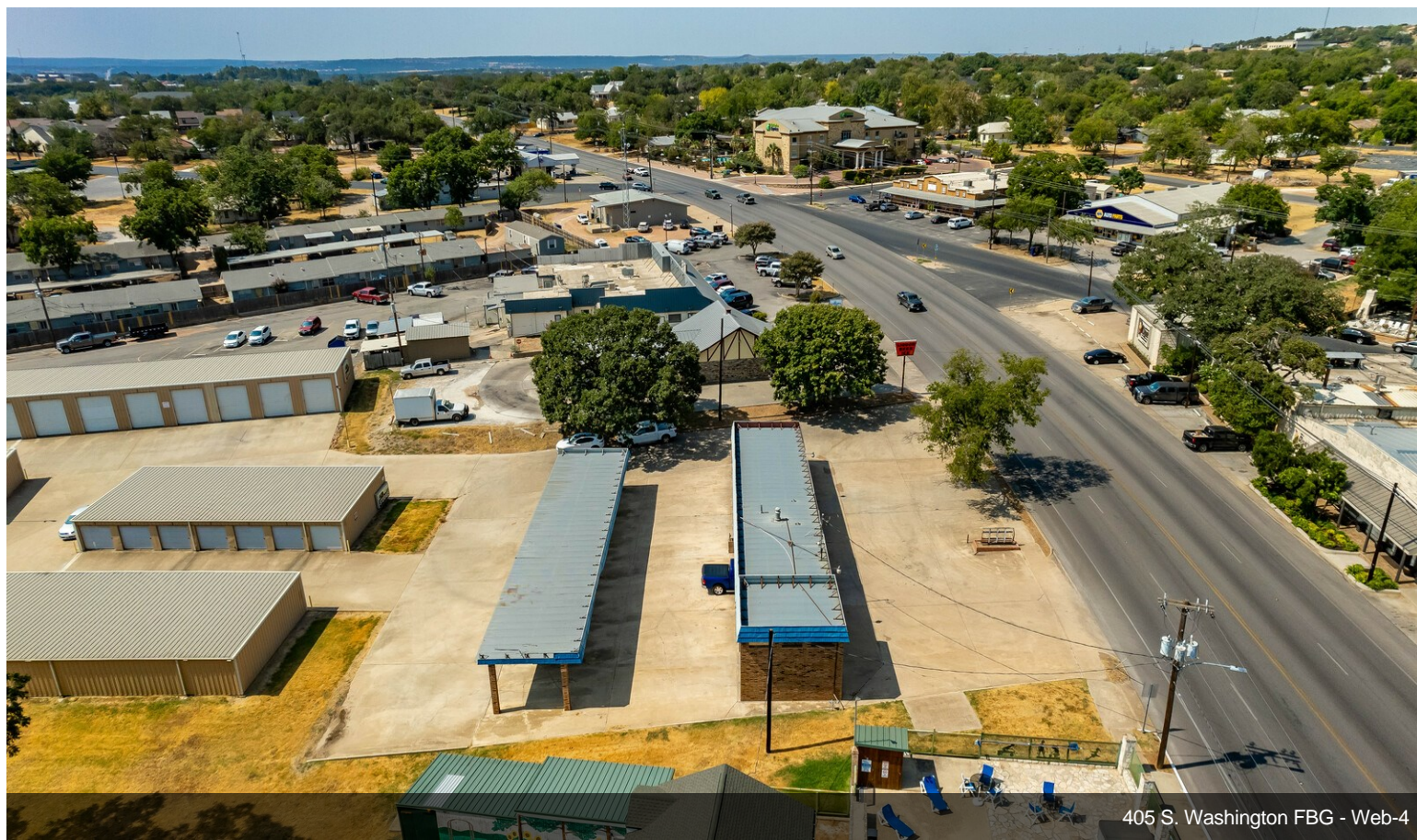
405 S. Washington FBG - Web-4