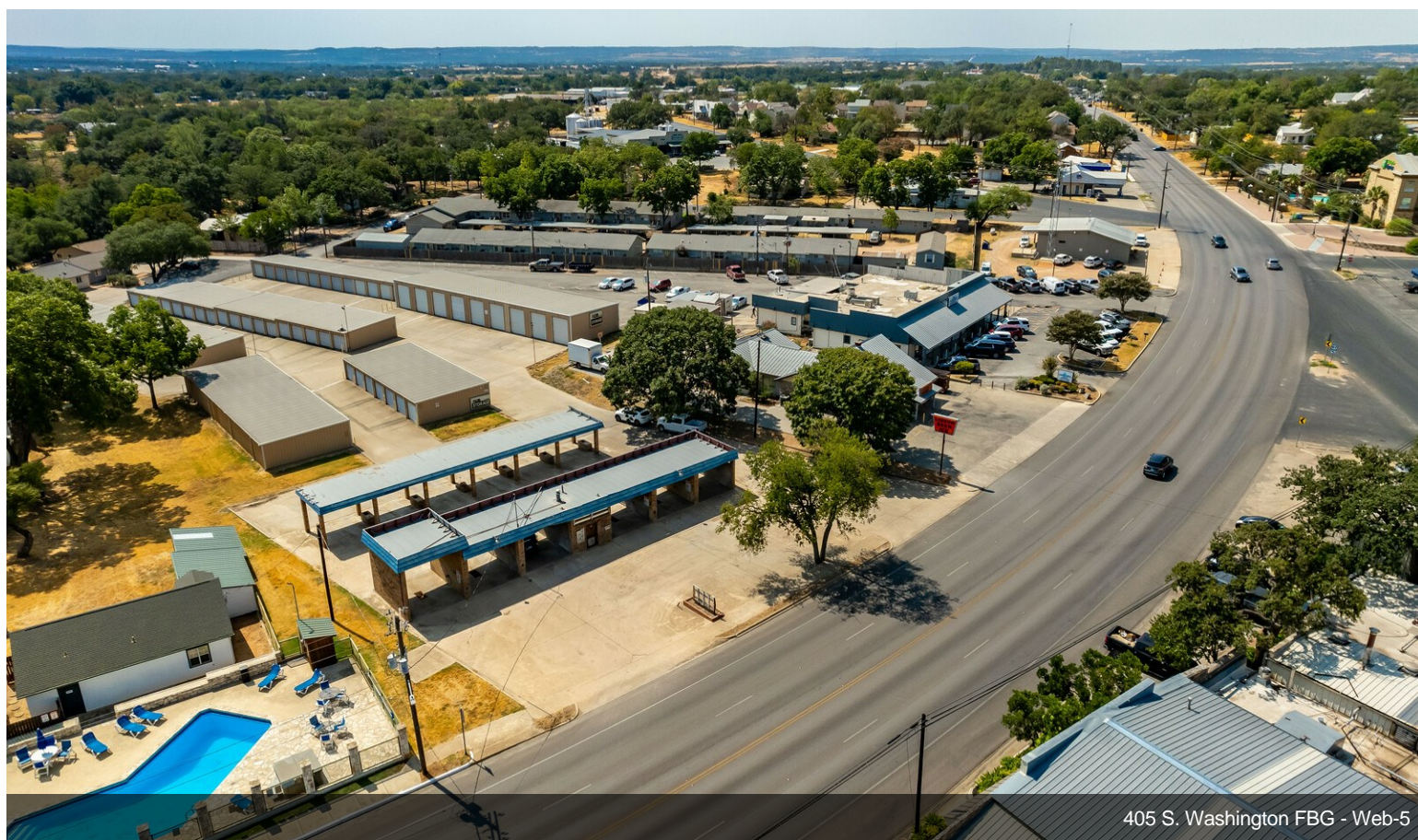
405 S. Washington FBG - Web-5