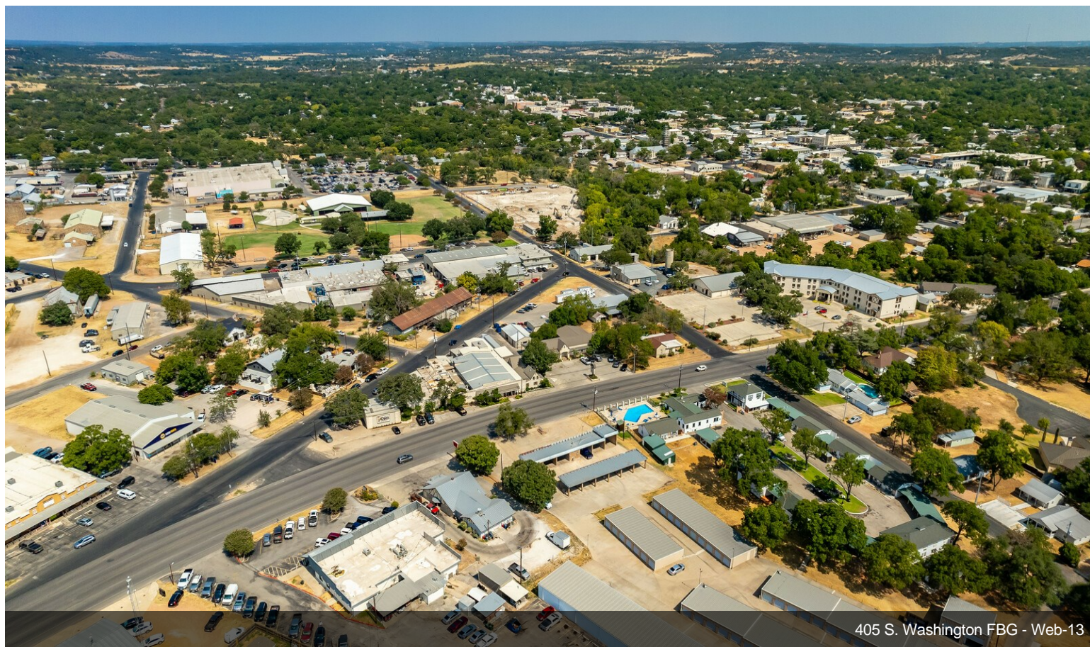
405 S. Washington FBG - Web-13