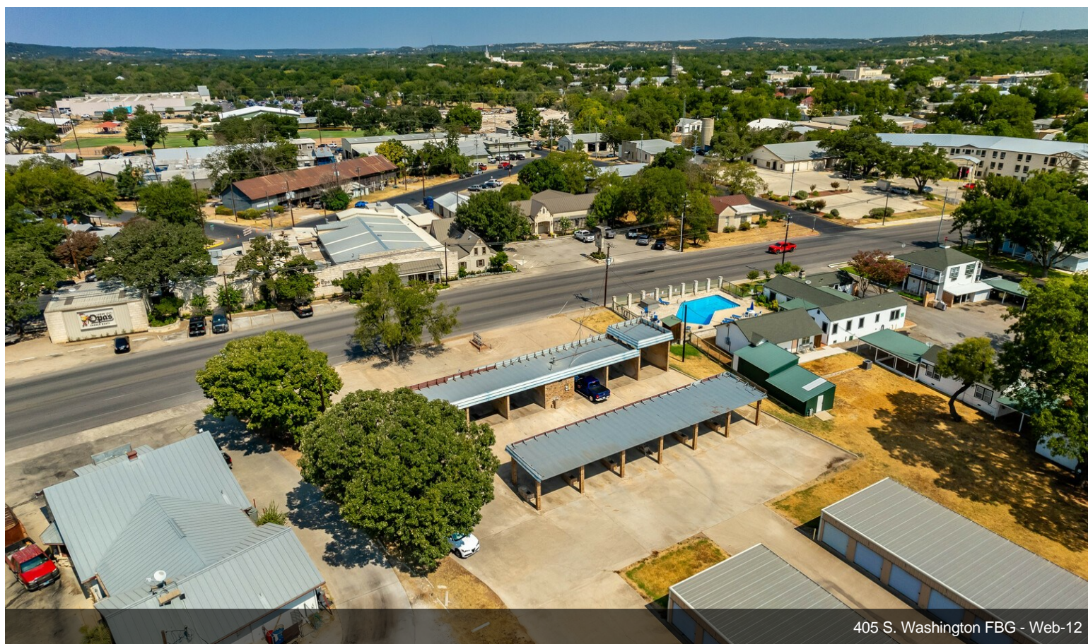
405 S. Washington FBG - Web-12