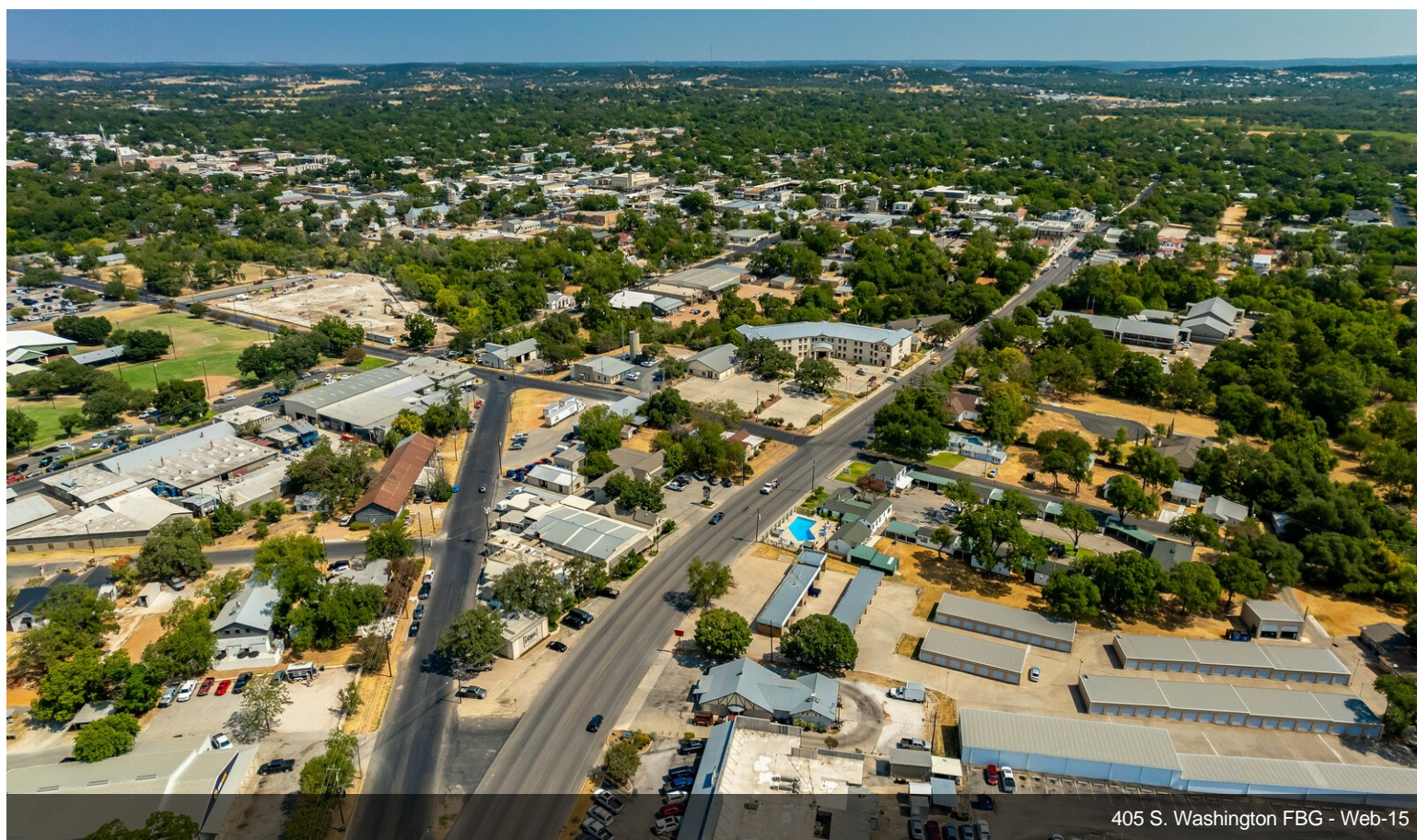
405 S. Washington FBG - Web-15