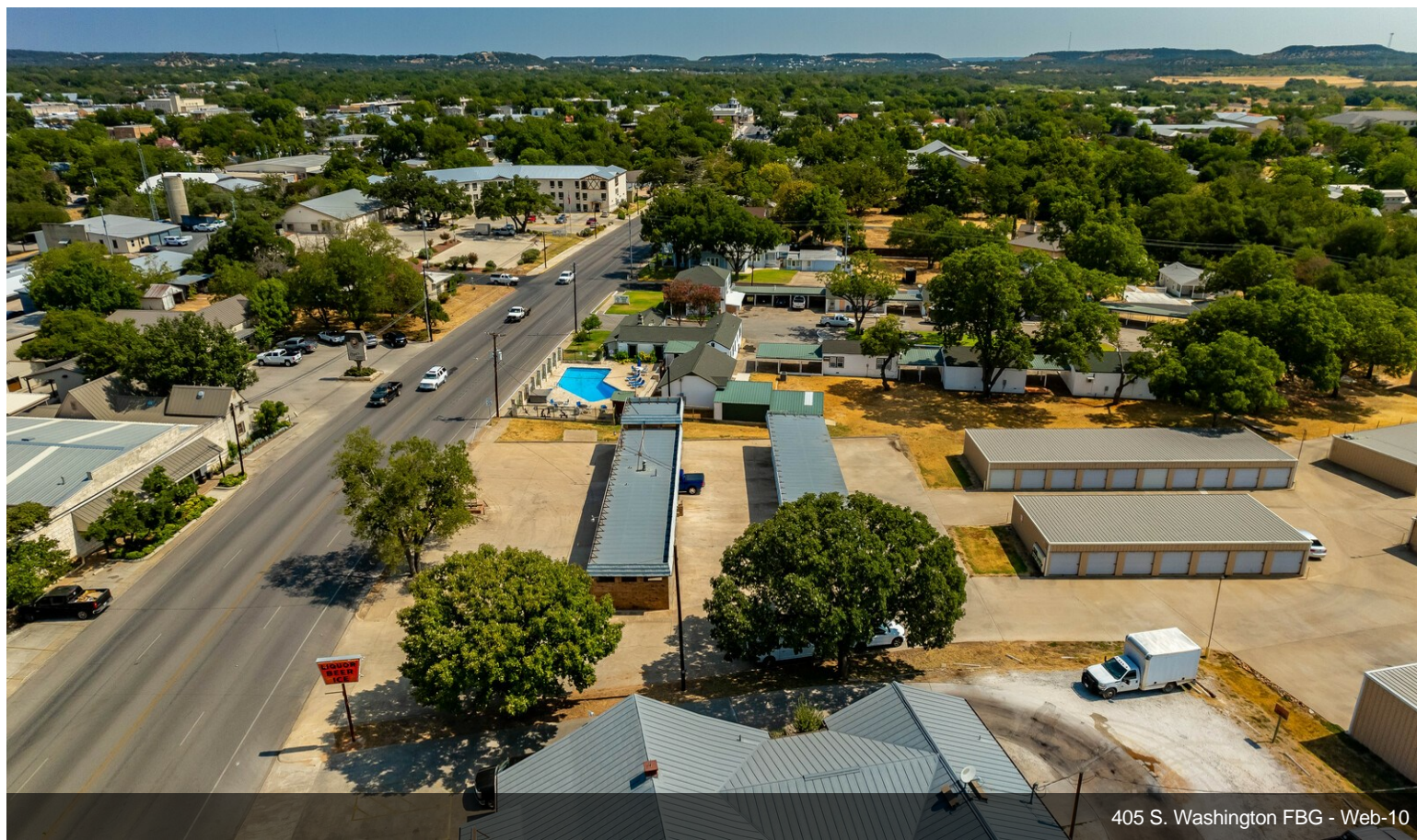
405 S. Washington FBG - Web-10