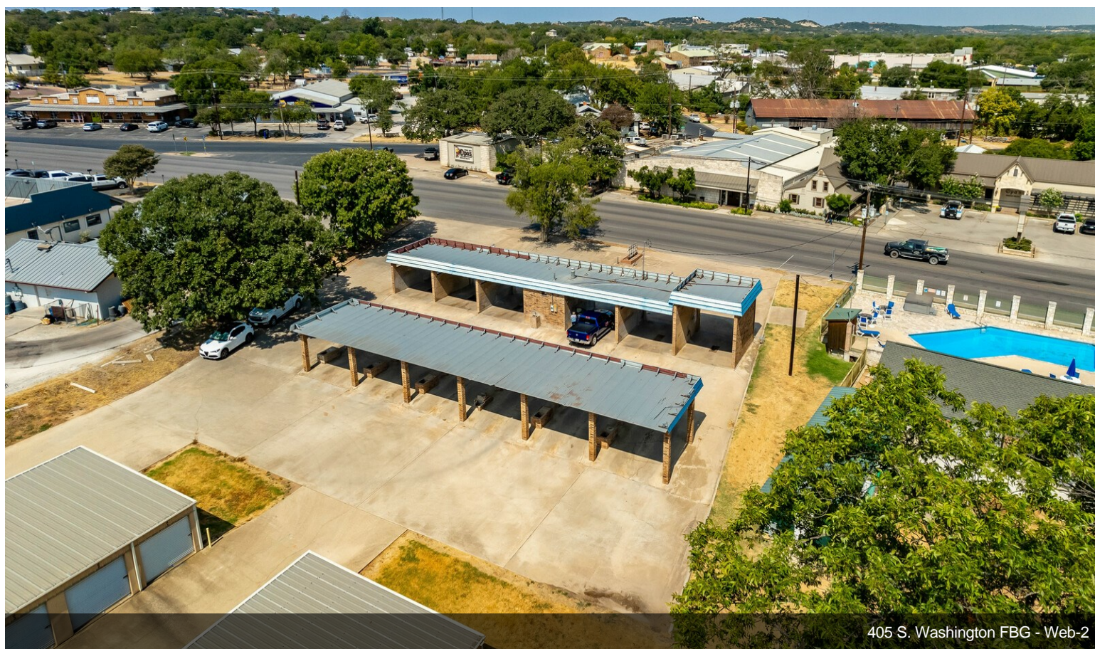
405 S. Washington FBG - Web-2