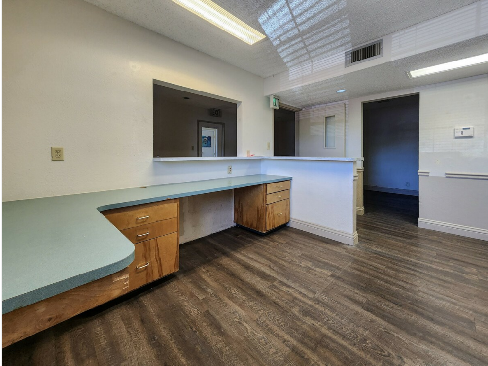
SUITE 3 RECEPTION AREA (2)