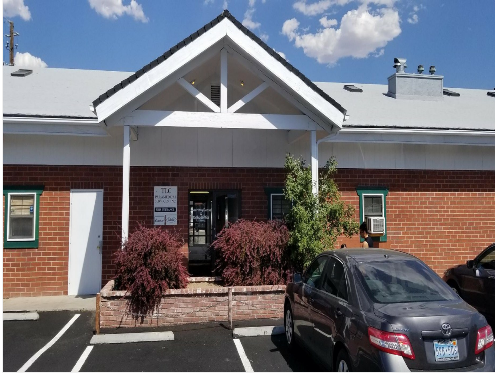
840 Broker Flyer FRONT Ste 1