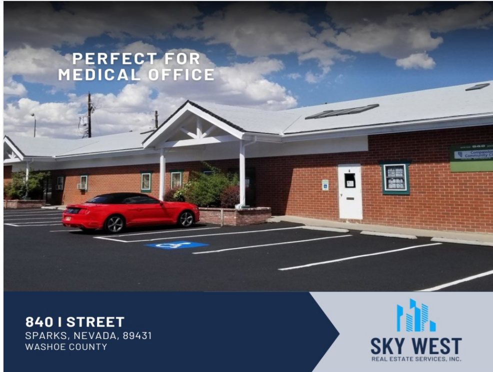
840 I STREET, SPARKS