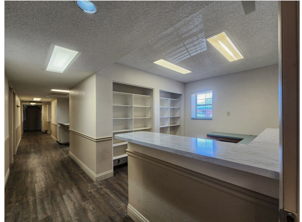
SUITE 3 RECEPTION AREA