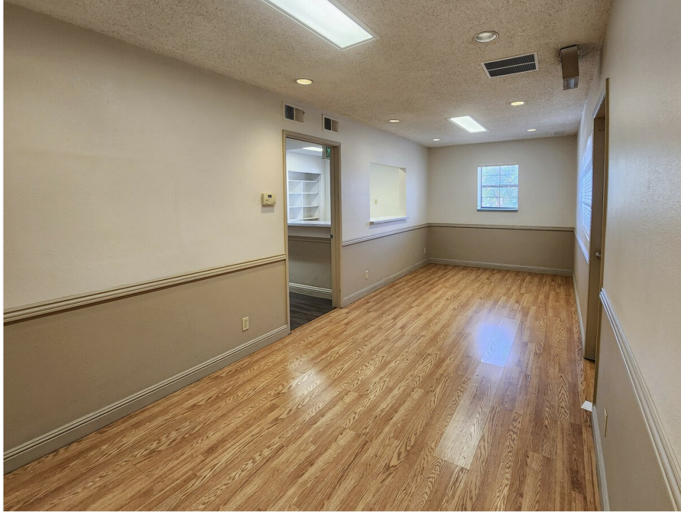
SUITE 3 WAITING AREA