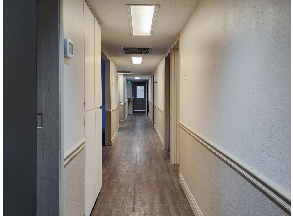
SUITE 3 HALL